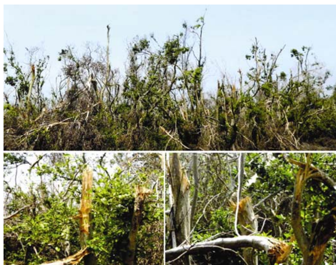
Figure 2. Mangrove forest struck by Thane cyclone 2011.