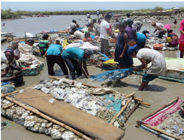
Cleaning process of window pane oyster in the intertidal area during low tide

shell collector travels 5 km up and down using specially made thermocol raft and collect shells daily by hand picking. Locally these sea shells are known as “Kachga” (Fig. 2). The collected shells are sold to the merchants at a rate of ₹ 6/kg. Each women collect on an average about 12-15 kg shells from the shore. During lowest spring tide, they are able to collect up to 25 kg. On an average, a woman makes ₹ 60-75 per day from the shells she collects. The survey conducted under NAIP project “strategies to enhance adaptive capacity to climate change in vulnerable regions” reveals that, after Dighi port construction, the nearby area of Kudgaon village has witnessed abundance of windowpane oyster. At present, the collection of windowpane oyster has become an alternative source for income of the fisherwomen in this region.