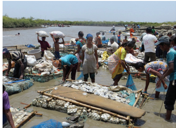
Window pane oyster collection activity being carried at community level along eustarine area of Kudgaon

related industries for capping and plugging the drilled holes that are left after oil exploration surveys. These shells are also used in handicraft industry. There are about 305 fisher families staying in Kudgaon village. About 80% of the village women have started collecting these shells (Fig. 1). Each