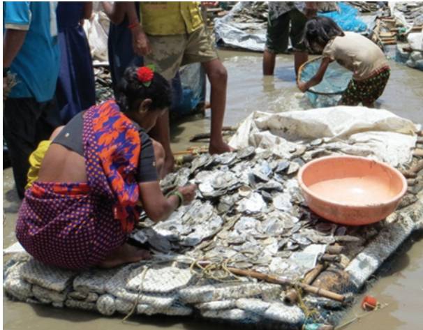
Fig. 1. Woman engrossed in sorting and cleaning of window pane oyster after collection by thermocol raft

Along with fisheries related activities, fisherwomen of Kudgaon, 6 km south of Dighi in Raigad district of Maharashtra, recently started collection of Mollusc shells (window pane oyster; Placuna placenta ) from the intertidal zone. There is great demand for these shells by petroleum