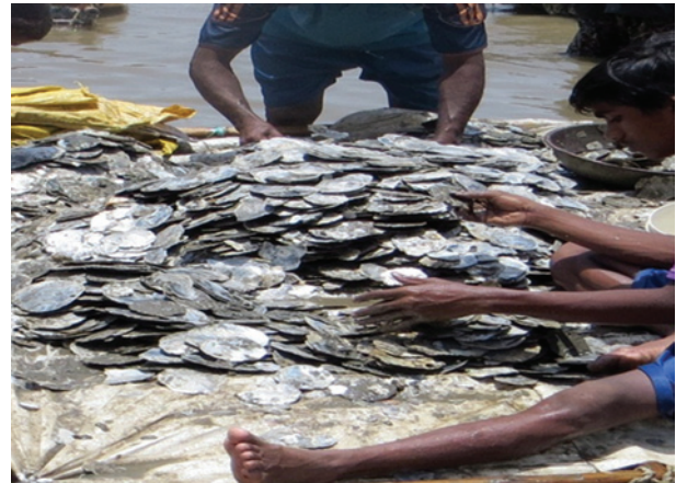
Fig. 2. Close view of window pane oyster