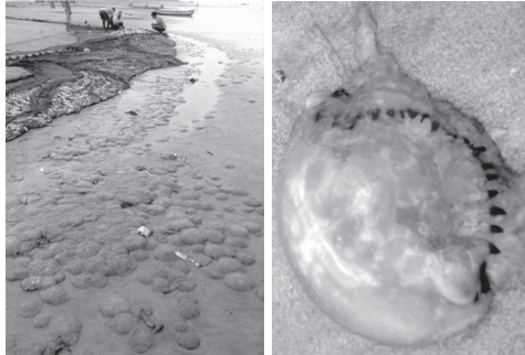
Fig. 1. Jellyfish landed in rampan operation

Unusual heavy swarming of jellyfishes were noticed along the Sindhudurg coast of Maharashtra during the months of October and November 2012. The jellyfishes, locally known as zhar/belaka, had dark yellowish gelatinous umbrella shaped bell and trailing tentacles. On 6 th November 2012, a total of 1000 kg of jellyfishes were landed in two rampan (shore seine) operations along with oilsardine (Fig. 1). Rampan as