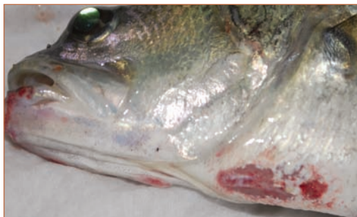
Fig.1. Ulceration in Vibriosis in Asian seabass

Vibrio species responsible for vibriosis can be presumptively diagnosed on basis of standard biochemical tests. However, serological confirmation employing serotype-specific polyclonal antisera is necessary. Although commercial diagnostic kits based on slide agglutination or ELISA have been developed for a fast diagnosis of vibriosis, they do not allow the distinction of serotypes and therefore are not useful for epidemiological purposes. Though DNA probe-based detection protocols are available, they are not specific and/or sensitive enough to be used in the diagnosis of vibriosis in the field.