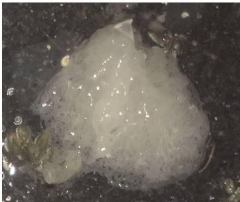
Fig. 1. Clathrina clara : specimens found on Pinctada fucata shell.

Latin clarus (= bright). Describing the bright surface (Klautau & Valentine, 2003).