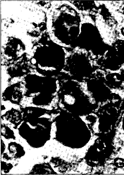
Fig.5. Enlarged view of a tubular lumen of hepatopancreas filled with sloughed epithelial cells and viral occlusions (H&E, X 1,000).