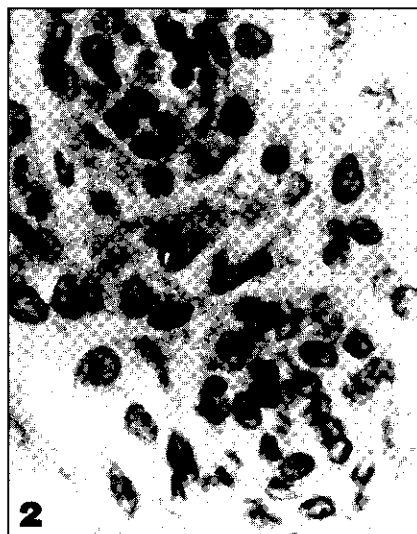
Fig.2. Histological section of lymphoid organ showing necrosis.