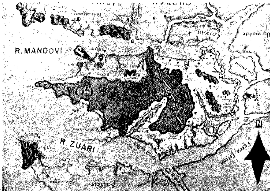
FIG. 2. A 16th century map of 'Uha de Goa' (Island of Goa) with its northerly projecting 'Rebunder Peninsula' (R) and 'Islet Pangim' (P). Extensive mudflat (M) is seen west of 'Rebunder Peninsula.' The Cumbarjua Canal (C) connecting the rivers Zuari and Mandovi is also shown.

Commensal Crab, Pinnotheres placunae Hornell and Southwell, was present in 2% of the window pane oyster examined.