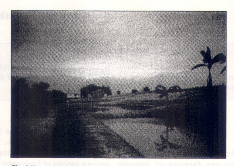
Fig. 2 Nursery ponds along with the side view of the community tank.

programs at district headquarters to disseminate the technology for fish culture to the remote areas.