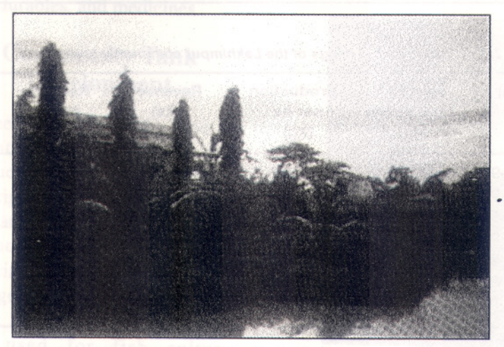
Fig. 4 Herbal medicine garden on the bank of the community tank.