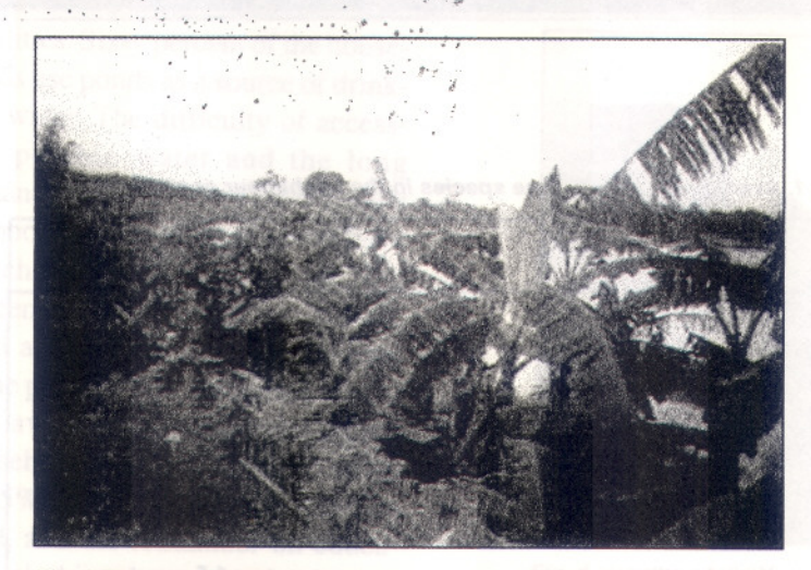
Fig. 3 Banana plantation on the bank of the community tank.