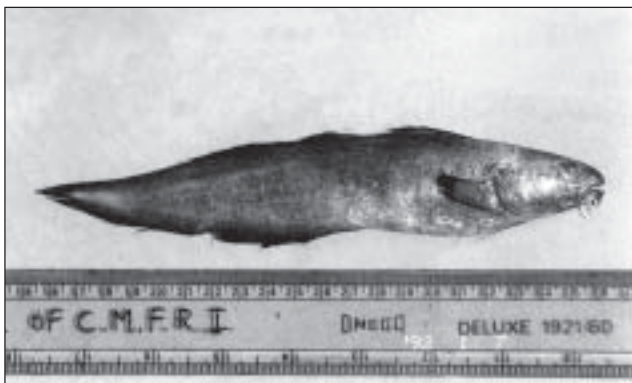
Brotula multibarbata (Temminck & Schlegel, 1846)

Occurrences of Brotula multibarbata commonly known as 'goatsbeard brotula' has been observed at New Ferry Wharf landing centre in Mumbai, in the second trawl net operations. The landings were during the second half of November 2003. It is a pelagic fish in