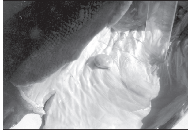
Plate 2 : Close up of the endo tumour in E. diacanthus