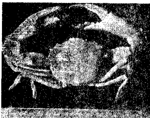
FIG. 1. Carcinoplax verdensis : First and second pleopod and abdomen of male.

depressed; three anterolateral teeth, of which tip of the 2nd tooth not reaching the level of the 1st tooth; chela stout and smooth; right chela slightly stouter and longer than the left; distal part of the fingers coloured with dark