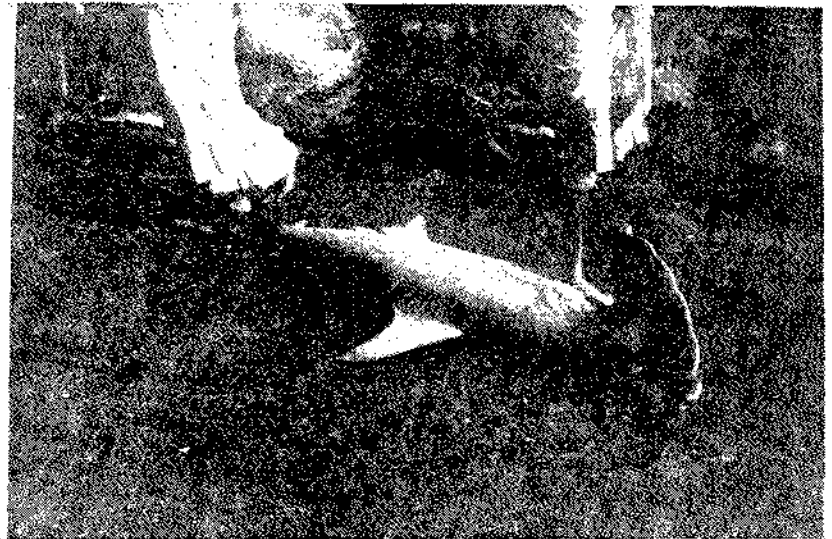
4. Sphyrna lewini - measuring 205 cm in total length.