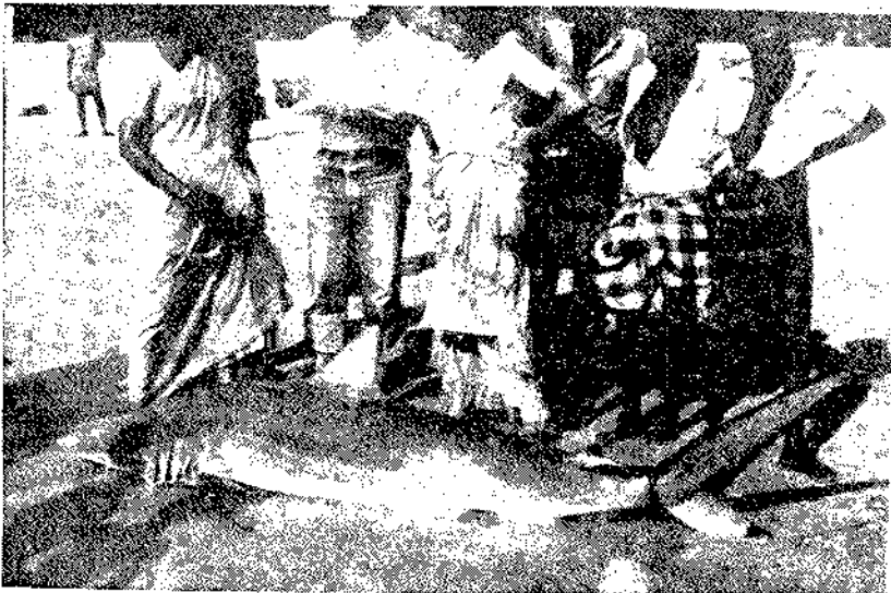
3. Carcharinus sorrah -measuring 273 cm in total length (the largest specimen ever measured) landed on 3-11-1988 at Malpe Kolam.