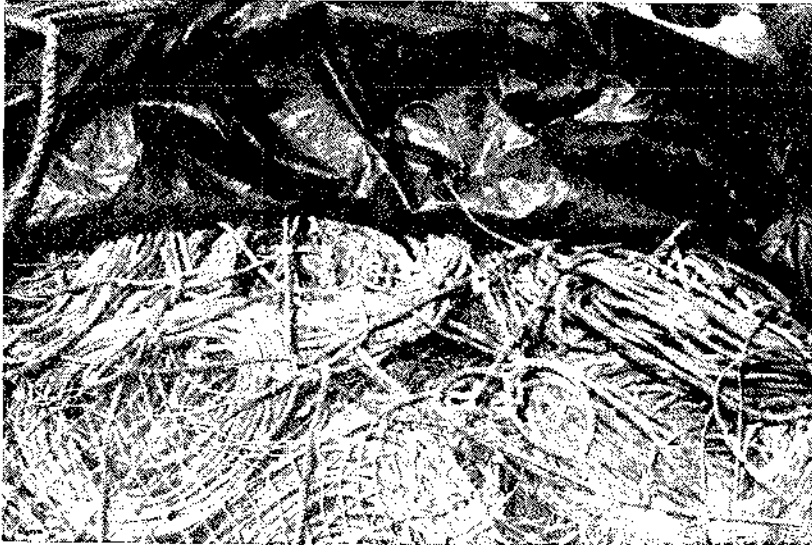
1. A long line kept ready on board to set out for fishing. A hook is shown to indicate the size.