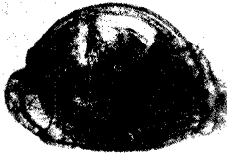
Fig. 1. Larval stages and spat of edible oyster Crassostrea madrasensis A.Stright-hinge stage. B.Umbone stage. C.Eyed stage. D.Pediveliger stage. E.Spat.