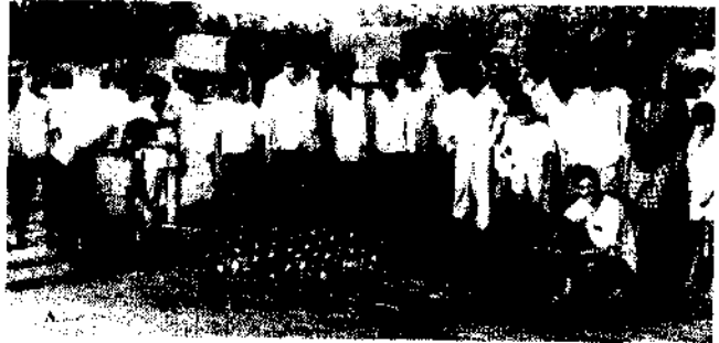
Fig. 1. The Whale Shark landed near Malvan, Maharashtra.

On 21.2.1992 a specimen of Rhinochimaera typus (whale shark) locally called 'Bhera' of 5 m length and 500 kg weight was landed at the Makarabagh fish landing centre near Malvan. It was caught in a trawlnet at about 15 km away from the coast where the depth measured 48 m. The fish was cut into pieces and sold to local people and a total of Rs. 400 was realised.