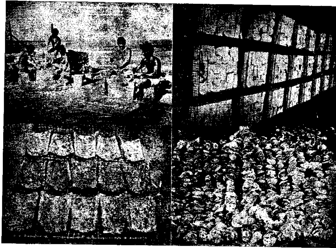
PLATE I A. Application of lime coating to tiles, B. Lime coated tiles kept in trays, C. Lime coated tiles with oyster spat attached and D. Oyster shells strung on galvanized wires for collection of oyster spat.