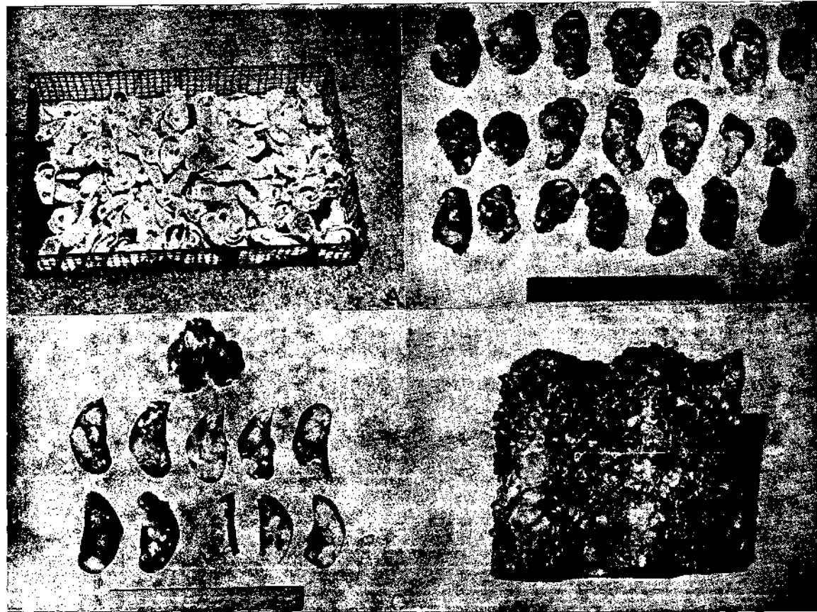
PLATE II A. Oyster shells kept in a tray for collection of oyster spat, B. Oyster spat which have set on oyster shell cultch, C. Oyster spat which have set on mussel shell cultch and D. Corrugated asbestos sheet cultch with oyster spat attached.