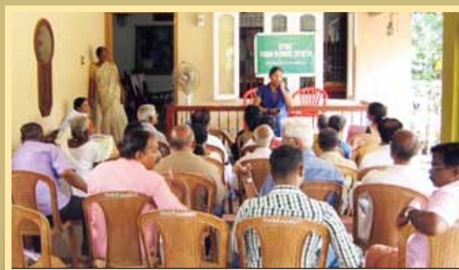
Off campus training programme