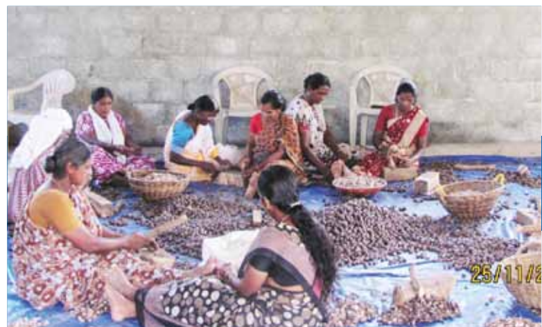
KVK facilitated nutmeg commodity interest group engaged in minimal processing

The nutmeg farmers from Kothamangalam used to sell their nuts and mace produce in dried form. There will be 30% reduction in weight while drying and a labour component is also involved. Sun drying becomes difficult during the peak yielding period as it coincides with South West Monsoon. KVK conducted a Nutmeg Buyer Seller meet at Kothamangalam and subsequently M/s Pepper India