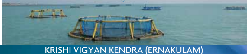
Sea cage farm at Mandapam Regional centre of CMFRI

Open sea cage farming is a promising venture which offers the fishers a chance for optimally utilizing the existing water resources. By integrating the cage culture system into the aquatic ecosystem, the carrying capacity per unit area is optimized because the free flow or current brings in fresh supply of water and removes metabolic wastes and excess feed. Thus economically speaking, cage culture is a low impact farming practice with high economic returns.