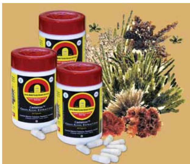
Green Algal extract (GAe)

Cadalmin™ Green Algal extract (Cadalmin™ GAe) provides a unique blend of pure natural bioactive anti-inflammatory ingredients extracted from seaweeds by an eco friendly technology to combat inflammatory pain and arthritis. Seaweeds possess valuable compounds that can offer relief to arthritis and associated joint pain. An intensive research in this area led them to perfect a patented anti-arthritic and pure vegetarian nutraceutical Cadalmin™ GAe from these valuable resources.