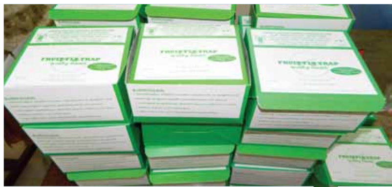
Fruit fly trap ready for sale

Farmers in Kerala are helpless as fruit flies lay their eggs on the flowers and immature