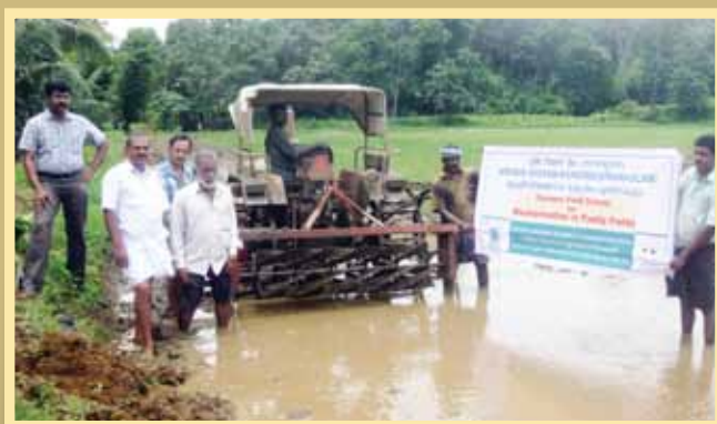
Field demonstration of Puddler