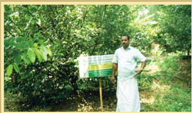
Farming partner - on farm testing in nutmeg