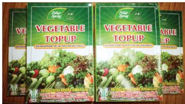
Vegetable top up

KVK received bulk orders from Department of Agriculture, Govt. of Kerala for its micronutrient mix Vegetable Top Up. The consignment is