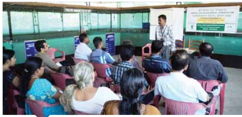
Training programme on Mushroom cultivation

Fifty three farmers from Perumpadappu and Thavanur Block of Malappuram District, Kerala visited KVK on 4th January 2014. The farmer's