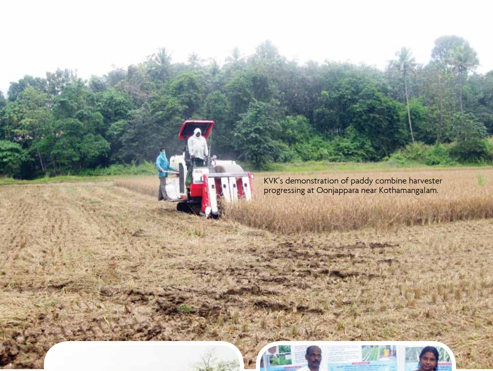
KVK's demonstration of paddy combine harvester progressing at Oonjappara near Kothamangalam.