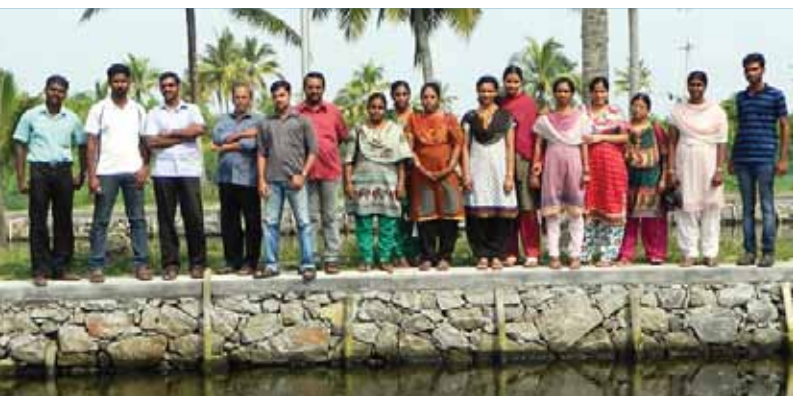
The fisheries department trainees at KVK

Sub Inspectors of Fisheries from Dept. of fisheries, Govt. of Kerala attended one day field training on Prospects and recent trends in Aquaculture at KVK on 23rd November 2013. The trainees were deputed from NIFAM-Kerala fisheries department training centre, Kadungallur.