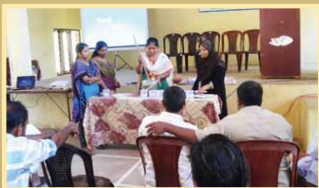
Method demonstration of panchagavya