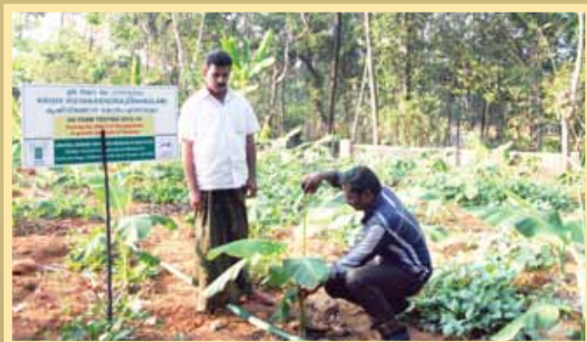
On farm testing - Field data collection