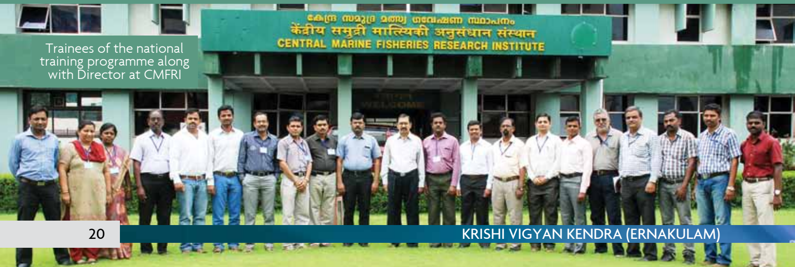
Trainees of the national training programme along with Director at CMFRI