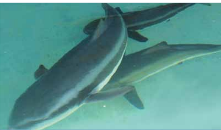
Cobia - Broodstock maintained at MRC of CMFRI

Cobias are marine fish species having fast growth rate, adaptably for captive breeding, low cost of production, good quality meat and high market demand. Cobia was bred for the first time in India at CMFRI during February, 2010. The technology has been disseminated to the fish farmers in East Godavari districts of Andhra Pradesh, and presently being demonstrated to several needy farmers on demonstration basis. This path-breaking technology will benefit the fishermen and will contribute towards the blue revolution