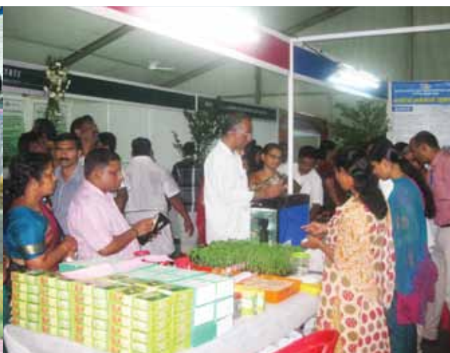
KVK-ATMA Technology meet