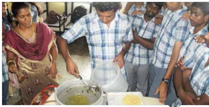
On the job training for VHSE students (Fisheries)

KVK Conducted one day training on Modern approaches in Aquaculture for VHSE Aquaculture students from Govt. Vocational higher Secondary School, Narakkal on 29th October 2013. Conducted six days training on Fish processing Technology for 59 students from VHSE,Narakkal from 18.10.2013 to 25.10.13.