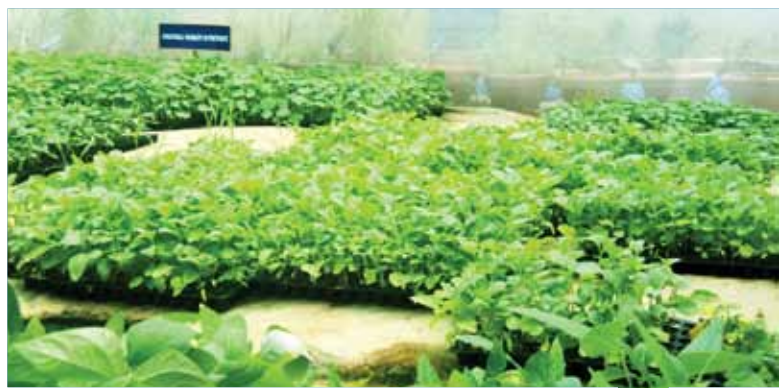
Seedlings ready for sale in KVK seedling production unit

There is a shift from seeds to seedlings in recent times. KVK produced and supplied 27,000 number of vegetable seedlings last year. Protray grown seedlings in coir pith compost medium were available round the year. Good quality seedlings of cool season vegetables Cauliflower and Cabbage were supplied in addition to