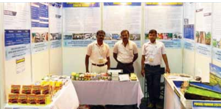
KVK exhibition stall at Krishi Vasant 2014 at Nagpur

KVK set up exhibition stall in the Krishi Vasant, 2014 agricultural exhibition at Nagpur during 9-13 February 2014-. The mega event was organised as a large congregation of farmers