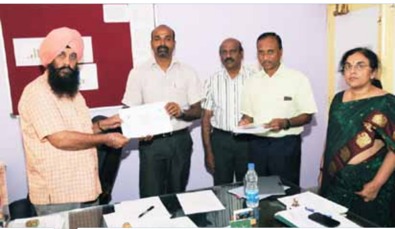
IIHR Director handing over technology of vegetable special to KVK

KVK purchased three technologies for commercial production from Indian Institute of Horticultural Research, Bangalore. The technologies are Banana micronutrient mix, Vegetable micronutrient mix and bio pesticide