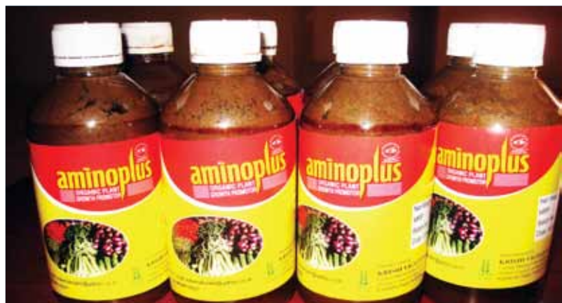
Fish amino acid ready for sale

KVK initiated production and marketing of Fish amino acid in the trade name Amino Plus in 200 ml bottles. It's a unique organic nutrient made from sea fish for improving health and productivity of crops. Fish Amino Acid acts as a plant growth promoter and improves the immune support system in plants. When applied as foliar spray, it helps to increase