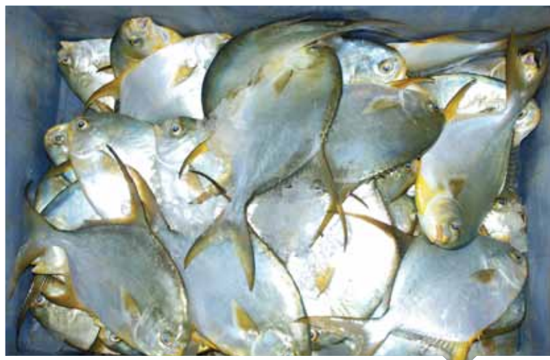
view of harvested Pompano

Silver pompano, has fast growth rate and high market demand. Central Marine Fisheries Research Institute developed broodstock, done