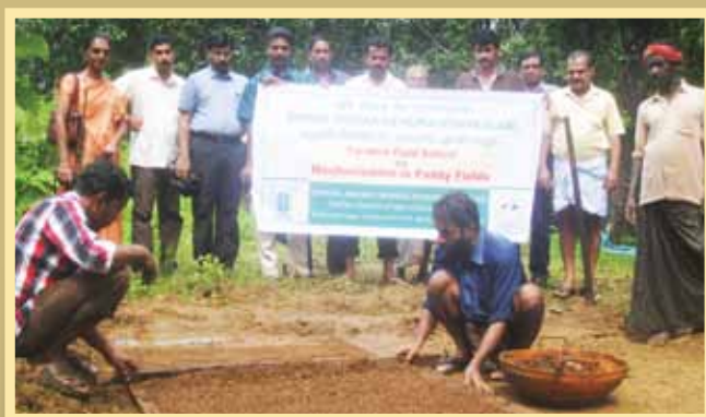
Training in mat nursery preparation