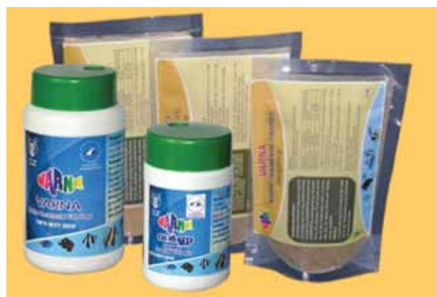
Varna - Marine Ornamental Fish Feed

CMFRI developed an optimized method to produce feed for marine ornamental fishes. Presently, formulated feed for marine ornamentals is not indigenously produced, and the demand is met through imports with a price tag in the range of Rs. 4000 per kg. CMFRI