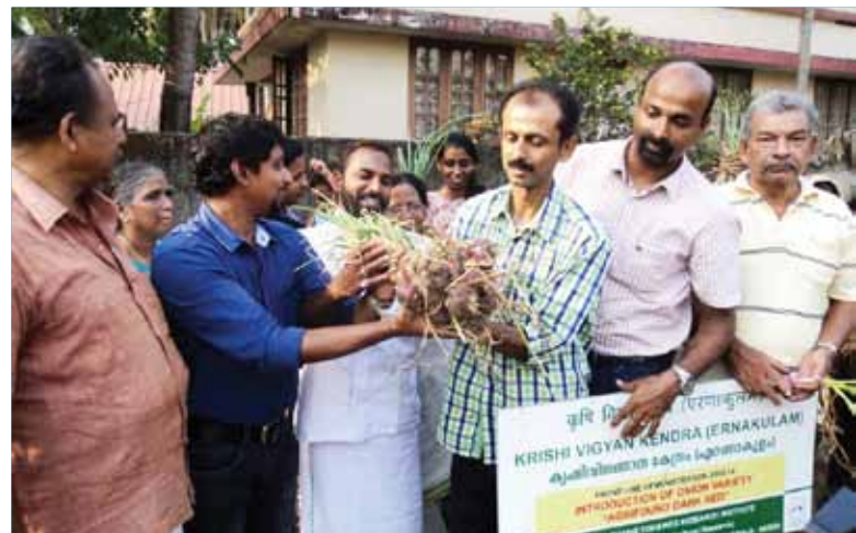
handful of onion harvested during a harvest mela in Ernakulam

There is a general concept that onion cannot be cultivated in Kerala conditions and the only way is to purchase from market. It’s wrong! You can now start onion cultivation in homesteads, kitchen gardens and also in roof tops. 2.5