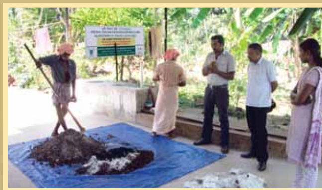
Method demonstration - preparation of Azospirillum culture at farmers field