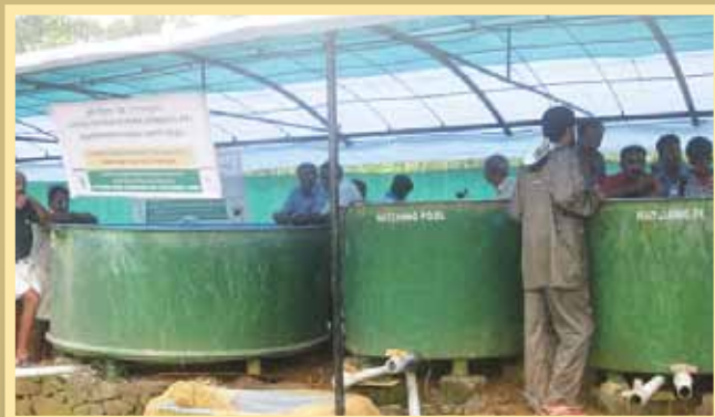
Portable carp hatchery installed in a farmers field