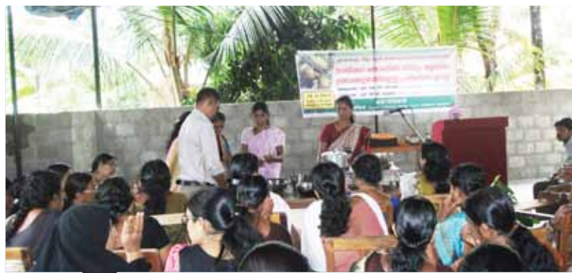
Entrepreneurship development programme on nutmeg rind value addition