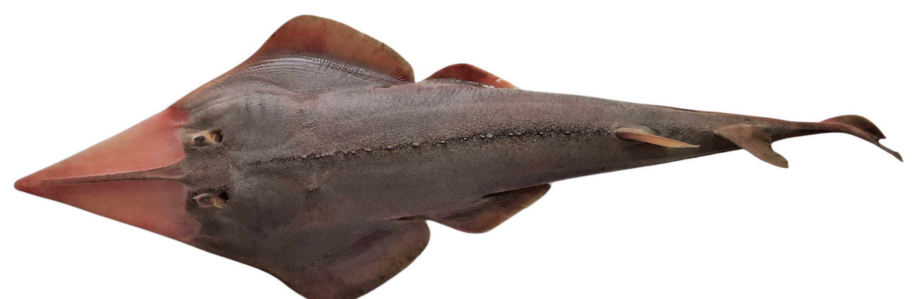
Glaucostegus spp. Giant Guitarfishes

ICAR–CMFRI is the recognized CITES scientific authority in India for marine species and trade regulation