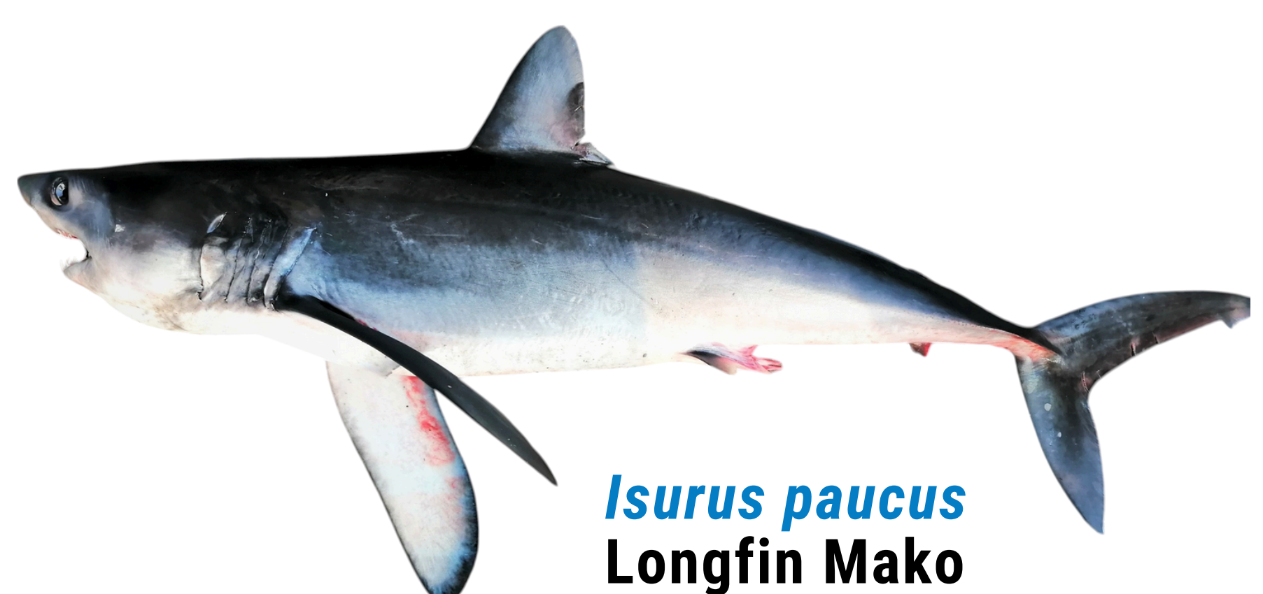
Isurus paucus Longfin Mako