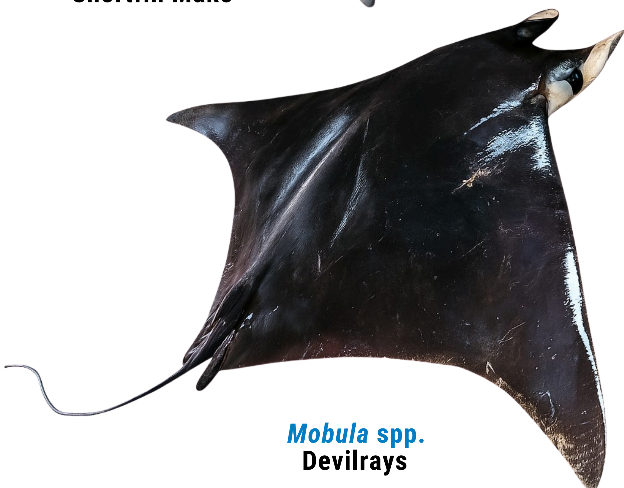
Mobula spp. Devilrays

The Wild Life (Protection) Act, amended in 2022 by the Govt. of India, aligns national legislation with global commitments under the Convention on International Trade in Endangered Species of Wild Fauna and Flora (CITES)