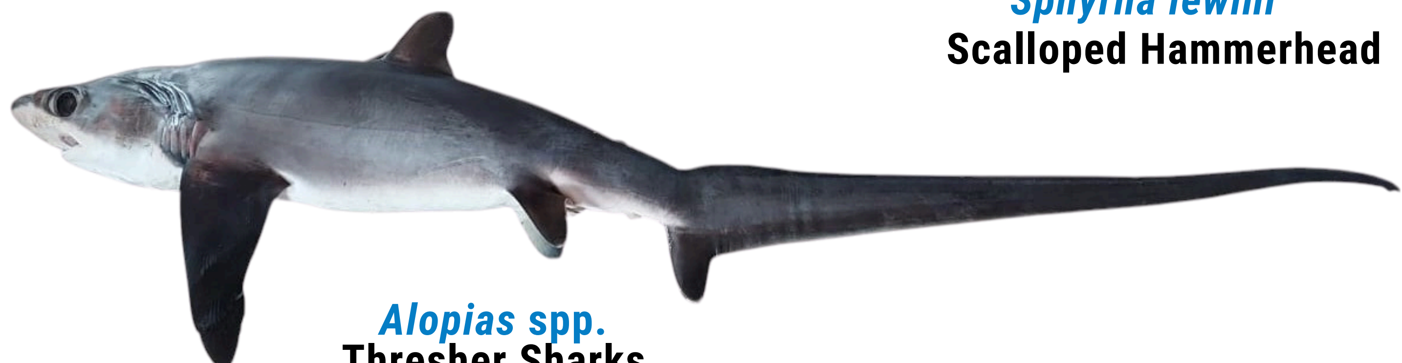
Alopias spp. Thresher Sharks