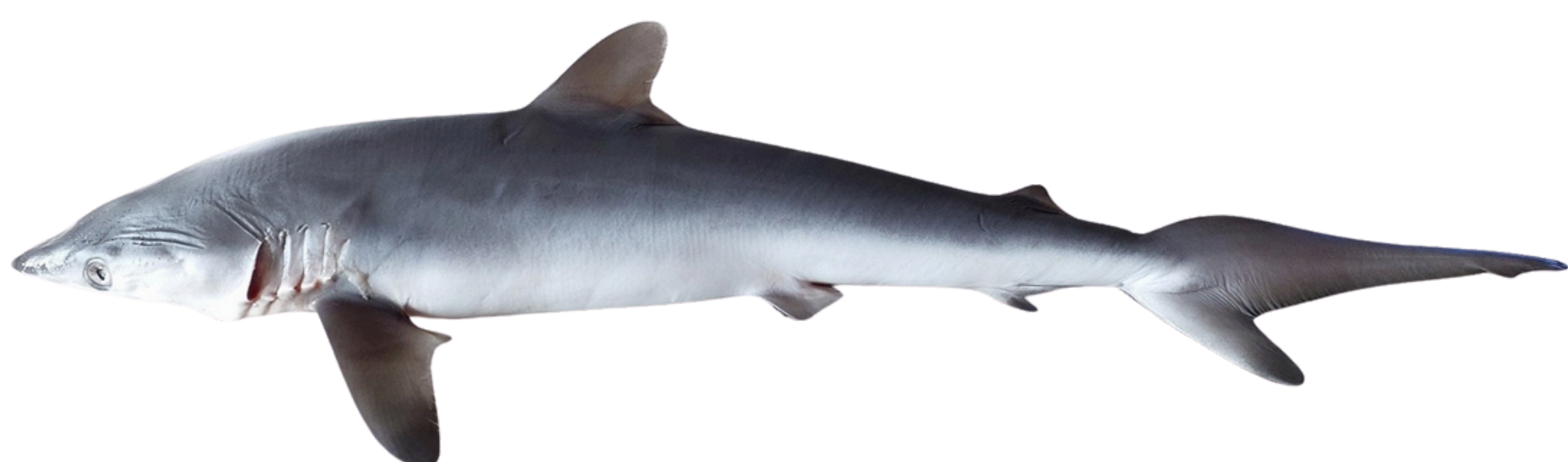
Carcharhinus falciformis Silky Shark

International trade is regulated for species in Schedule IV