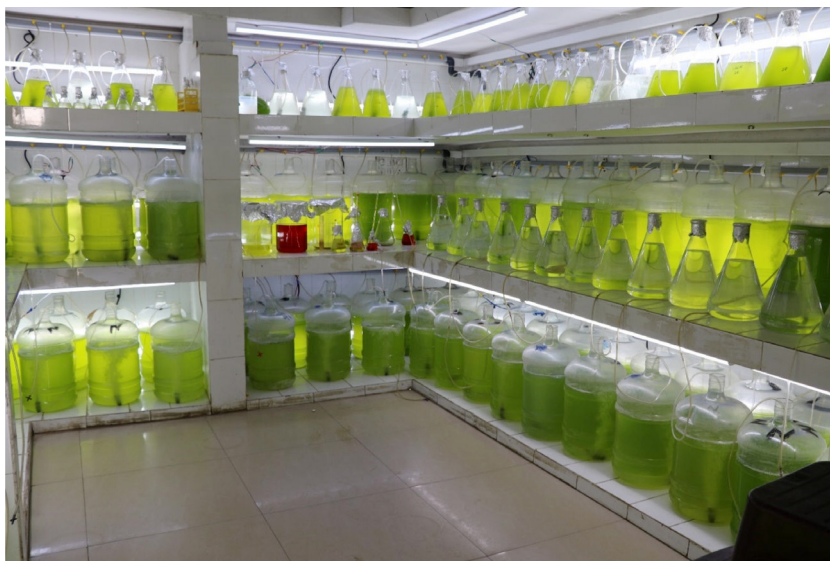
Illumination in indoor algal culture

It is one of the important factors for successful microalgae culture, but the requirements vary with the species, culture depth and the density of the algal culture. For maintaining the stock cultures of all micro-algae 500 Lux (one tube light) is essential while for the mass culture containers, 2000 - 10000 Lux is necessary. The light intensity must be increased and should be sufficient enough to penetrate through the culture, if cultured at higher depths, large volumes and higher cell concentrations (E.g. Erlenmeyer flasks - 2,000 Lux; Larger volumes - 5,000-10,000 Lux). Fluorescent white lights are mostly used in indoor microalgal culture facilities, which can provide 2,500 Lux, while outdoor systems and greenhouses gets ambient sunlight, and if needed fluorescent lights are used. Most of the flagellates require less light during the stationary and declining phase. Too much of light intensity will cause early declining of the culture. Fluorescent tubes should be preferred as these are the most active portions of the light spectrum for photosynthesis. The duration of artificial illumination should be 16 h (minimum) of light per day, although cultivated phytoplankton develops normally under constant illumination.