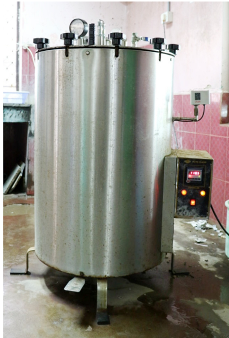
Heat sterilization by autoclaving

Heat sterilization of filtered seawater can be either done by autoclaving (for small volumes) at 121°C (250°F) at 15 psi for 15 minutes or by a glass-lined water heater of 500 to 1,000 W submersion heaters for large volumes of 20 liter and above. Microwave sterilization is useful for small volumes of seawater to prepare micro nutrient and trace mineral stock since they are volatile. Nutrients can be added before microwaving since the temperature will not exceed 84 °C. So depending upon the volume and usage, the method of heat sterilization can be decided.