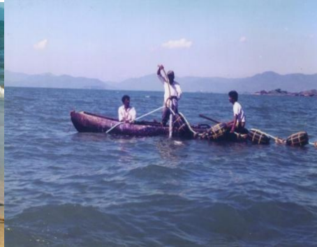
Tying of the seeded ropes