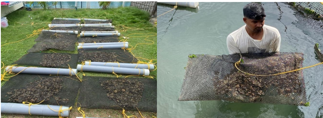
Farming of cultchless oysters in HDPE Net bags

In this method, oyster juveniles are introduced into the bags typically made of mesh or other permeable materials, allowing for water circulation and the exchange of nutrients essential for oyster development. This technique not only eliminates the need for natural cultch, streamlining the farming process, but also offers several advantages.