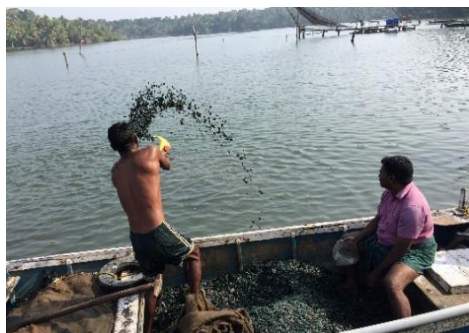
On-bottom culture in open water

In on-bottom culture, mussel seeds are relayed on the bottom of a water body leaving them to grow until the harvest, and this is generally practised in open waters or pens which can also be practised in shrimp or fishponds at a low stocking density. In this case, the mussel seeds will form clumps within a week and grow. This method is widely practised in Ashtamudi and Kasaragod.