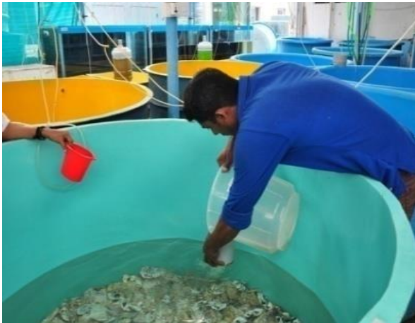
Setting of oyster larvae

Cultch-less spat can be produced in micro-nursery using upwelling downwelling systems as described in the mussel chapter.