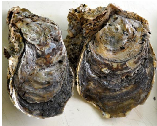
Indian edible oyster ( Crossostrea madrasensis )

Though the complete package of seed production and oyster farming technology has been developed by CMFRI, oyster culture is not yet developed in India due to lack of awareness regarding the nutritional quality, non-availability of seed and lack of entrepreneurship. However, it is one of the most preferred seafood items in Europe, USA and many south-east Asian countries and there is immense scope for export if produced in sizable quantities.