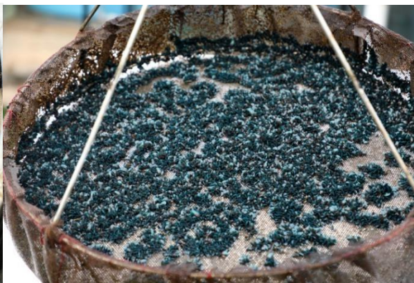
Seed grown in ring net

The seed produced from the system can be seeded on ropes, can be kept for a week in the system for attachment, and sold as seeded ropes. Seeded ropes are taken to the backwater farms and tested in floating rafts and have shown good growth and survival.