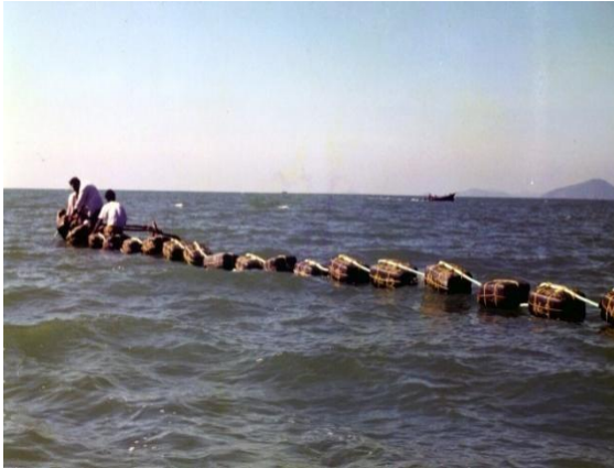
Low-coast long-line (Karwar)

The long line is made of a 50-150 m long and 16-22 mm diameter synthetic rope which is held afloat with barrels or large floats and moored with anchors. The seeded ropes are suspended from the mainline. Sea farming of mussel is vulnerable to poaching, unpredictable climatic conditions and predation.