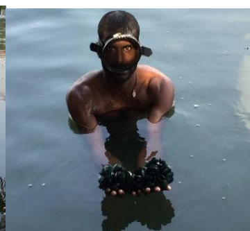
Clump formation of seed