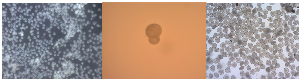
Pear shaped eggs

Larval stages of edible oyster, Crassostrea madrasensis