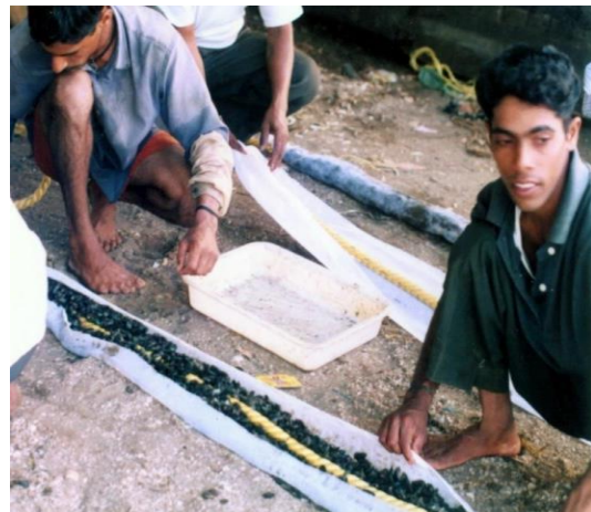
Seeding the rope

The length of the seeded rope ranges between 1-2 m depends on the water depth. At first, a mosquito net of 20-25 cm width and required size is cut and spread on a smooth and flat surface in a shady place. At the middle of these pre-arranged netting, a rope of 18-22 mm diameter is placed lengthwise. The spat of 15-25 mm @ 600-1000 g/m is spread uniformly in the netting and over the rope and thereafter wrapped the netting by keeping the rope at the centre and stitched tightly to get the spat cover around the rope. For avoiding slippage of mussels, knots are made, or 10-15 cm length bamboo peg is inserted horizontally in between the twists of the seeded rope at regular interval of 25 cm.