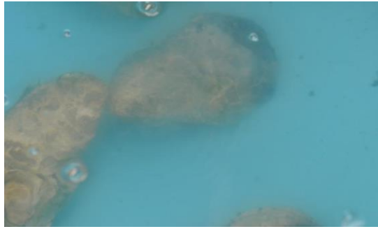
Oyster spawning in progress (release of milky fluid)

Excess sperm in spawning tanks can cause abnormal fertilization of the eggs so it can be avoided by removing surface water with sperm replacing with fresh seawater.