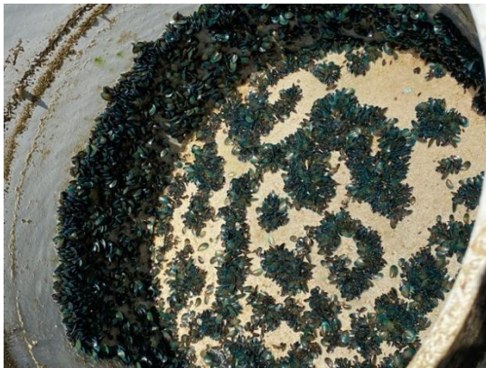
Seed raised in silo

Mussels spat of 1mm size can be nursery-reared successfully in a multitrophic hybrid biofloc system that incorporates the benefits of Integrated multitrophic aquaculture (IMTA), Biofloc Technology and Recirculating Aquaculture Systems with apparent advantages such as reduced environmental impact, higher production potential from limited land and water usage and sustainability. The main objective is nursery rearing of bivalve spat along with biofloc farming of white leg shrimp ( Litopenaeus vannamei ), which is based on the principle of IMTA where we use two or more species belonging to different trophic levels where one organism utilises metabolic wastes of the other species as a source of energy.