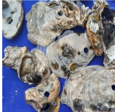
Oyster spat grown on the shell