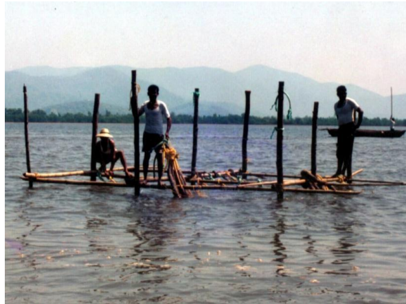
Rack for Mussel farming in Kali estuary (Karwar)

Rack culture is ideal for estuarine conditions where the water depth is in between 1.53 m. The ideal size of fixed rack culture is 25 m 2 (5x5 m) which is fabricated by placing bamboo /casuarina poles and tying with nylon ropes. Nine poles having length more than the water depth during