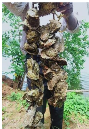
Ren with harvestable sized Oyster