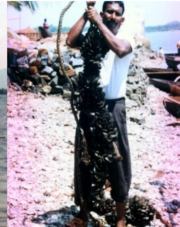
Harvested mussel rope

maximum high tide is driven into the bottom and spaced at a distance of 2.5 m apart, and it is connected each other in both directions by horizontally placed six poles of more than 5 m lengths. The horizontal poles should be above the water level at high tide, and the seeded ropes are suspended from it. In shallow areas of below 1.5 m depth, both ends of the seeded ropes are horizontally tied on to poles.