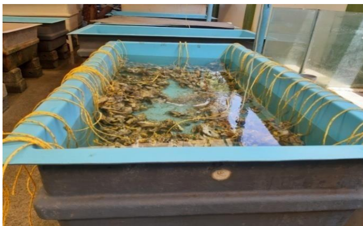
Prepared oyster rens kept in the tank for settlement and rearing