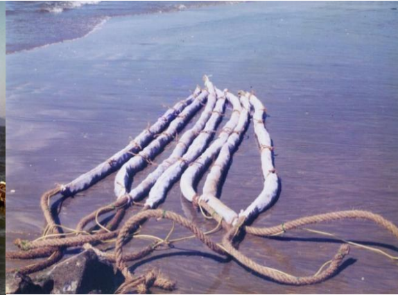
Seeded rope (5m)