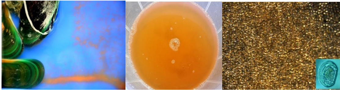
Fig 1: Spawning of P. viridis