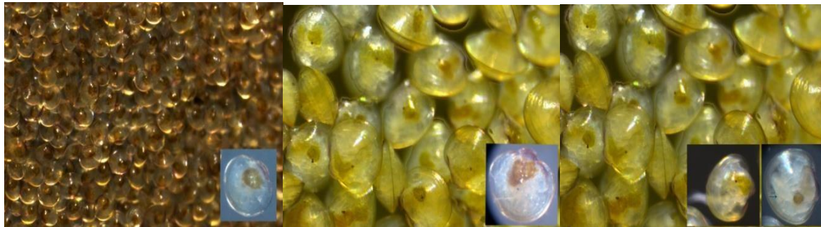
Fig 4: Umbo stage