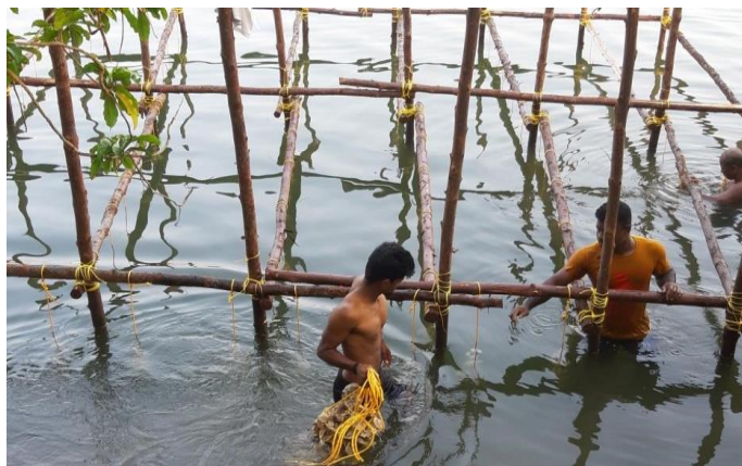
Oyster- rack culture (7x7 m) tying of the ren to the rack

The rack and ren method is ideal for estuarine conditions where the water depth is in between 1.2-3 m. The ideal size of a fixed rack is 5X5 or 7 X 7 m in dimension (49 m 2 ) which is fabricated using bamboo/casuarina pole and tying them together with nylon ropes. Sixteen poles having length more than the water depth (at maximum high tide) is driven into the bottom and spaced at a distance of 2.3 m apart and it is connected each other in both directions by horizontally placed 8 poles of 4-6 m length which are above the water level during high tide, and the 'rens' (oyster shell strings) are suspended from these racks.