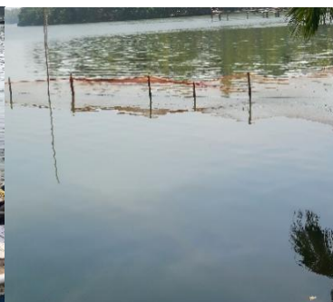
Pen for on-bottom culture