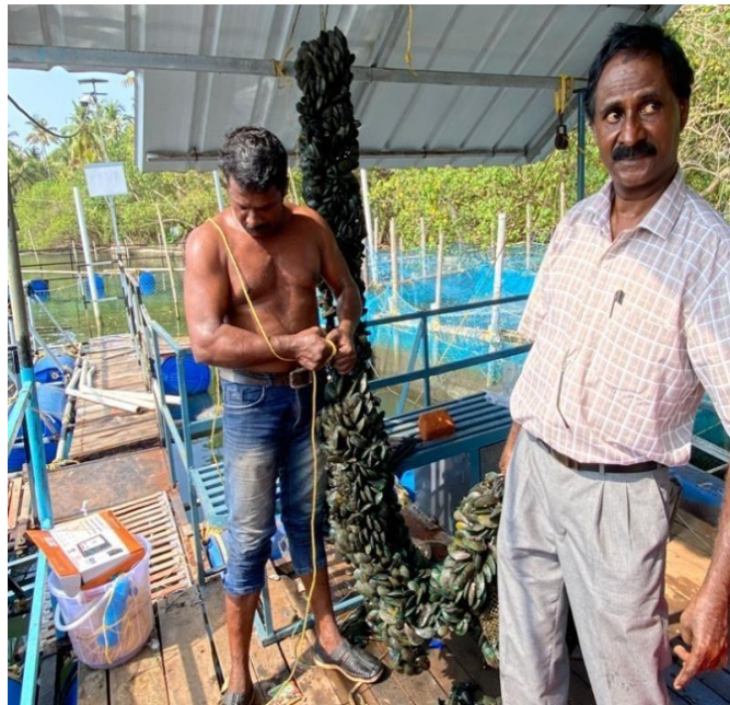
Harvested mussels using hatchery produced green mussel seed

Typically, harvesting of the mussel is done during April to June along the west coast of India and farmers are forced to sell their crop before the onset of monsoon to avoid mass mortality due to freshwater influx depending on the distance from bar mouth. Under culture conditions, green mussels and brown mussels attain a size of 80-88 mm (36-40 g) and 60-65 mm (25-40 g) respectively and yield production of @ 5-10 kg/m over 6-7 months. The farmed mussels give a better meat yield compared to mussels from the natural bed.