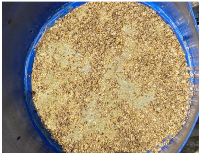
Single oyster spat in silo

Ripe Indian backwater oyster Crassostrea madrasensis are used for stripping. After opening the shell, male and female gonads were scooped out and squeezed. Squeezed gonads were suspended in seawater separately. Filtrate of male and female gonads are separately taken in beakers. The sperm suspension is activated using ammonium hydroxide and mixed thoroughly. Later 100-200 ml of sperm suspension was added to a beaker containing eggs to fertilize it. Further eggs were observed under the microscope to check the fertilization rate. Fertilized eggs were transferred to an incubation tank for hatching. The hatched-out D shaped veliger larvae were reared till they reached the eyespot stage (17-21 dph), feeding a combination of microalgae.