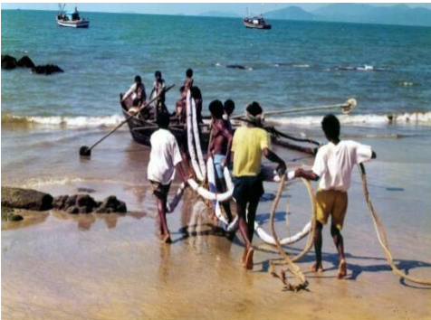
Transportation of seeded ropes