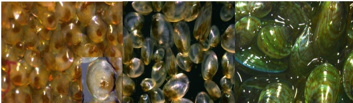
Fig 7: Plantigrade stage