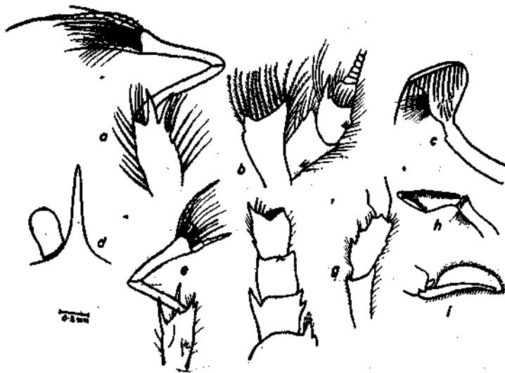
Fig. 1 Munida squamosa Henderson var. proluxe Alcock (a-c)- a. Antennule, b. Antenna, c. Second pleopod of male ; Munidopsis ( Munidopsis ) scobina Alcock var. indica (d-i)—d. Eye and rostrum, e. Antennule, f. Antenna, g. Middle part of third maxilliped, h. First pleopod of male, and i. Second pleopod of male.

Remarks : The rostrum, the spination on the anterior, lateral and posterior margins and on the gastric and the cardiac regions of the carapace are similar to those described by Alcock (1901). The basal segment of the antennule has 3 spines (Fig. 1a) situated on the outer margin of the segment, the anterior two being long and conspicuous and the posterior one small ; the inner distolateral margin of the segment is pointed. The basal segment of the antenna (Fig. 1b) has a knob-like