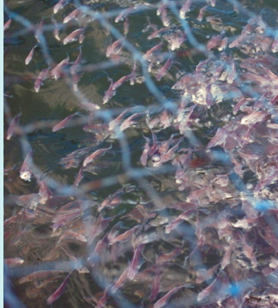
Pompano feeding on minced oil sardines

Farming of Pompano, Trachynotus blochi and Cobia, Rachycentron canadum was initiated in open sea cages for the first time by CMFRI at Karwar. 2000 fingerlings of Cobia with an average length of 9cm and 2500 numbers of Pompano with an average length of 5cm was transported from the Mandapam Regional Centre of CMFRI in October 2011. These seeds were stocked in two 6 meter cages in the marine farm of CMFRI at Karwar. Feeding was initiated on the same day evening by minced sardine meat. Cobia had shown a growth rate of 14 cm in one month where as pompano had grown by 6 cm in one month. No mortality had occurred either in transportation or in the cages. Both species offers immense potential for farming in the coastal waters.