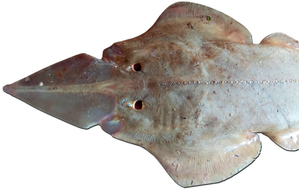
Fig.5. Rostral deformity in Glaucostegus granulatus

(Fig.4 & 5). Both the dorsal fins and caudal lobes were poorly developed with the curved vertebrae of tail in the first specimen while the second one was having unfused pectoral fins to the snout forming clefts in both sides. The abnormalities in granulate guitar fish is recorded for the first time from India. Spinal scoliosis and abnormal curvatures in the vertebrae has been reported in several elasmobranch species (Moore, 2015). One specimen of Silver pomfret ( Pampus argenteus , Standard Length (SL) 21.8 cm) was also observed to have an atrophied caudal fin without any dorsal and ventral lobes (Fig.6). This does