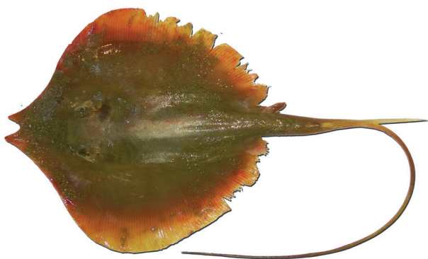
Fig.1. Rostral deformity in Brevitrygon walga

between the pectoral fin and rostrum (Fig.1). In the case of Pateobatis bleekeri (Female adult, DW 120 cm), the deformity was seen in the rostral bone making the rostral part slightly elevated and curved (Fig.2). The embryo of Scoliodon laticaudus was found to have scoliotic, lordotic and kyphotic bends in the vertebral column. The body had a hump like structure behind the head and the rest of the trunk was rolled clockwise up to the caudal region. The eyes and gills were well developed in the cephalic region but the fins were malformed (Fig.3). In case of Glaucostegus granulatus (Two adult females, TL: 137cm and TL: 183 cm), the tail and rostral portions were found to be deformed