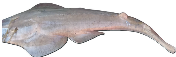
Fig.4. Deformity in the tail portion of Glaucostegus granulatus