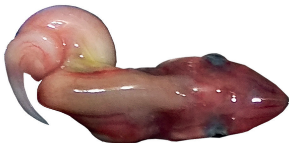
Fig.3. Deformed embryo of Scoliodon laticaudus