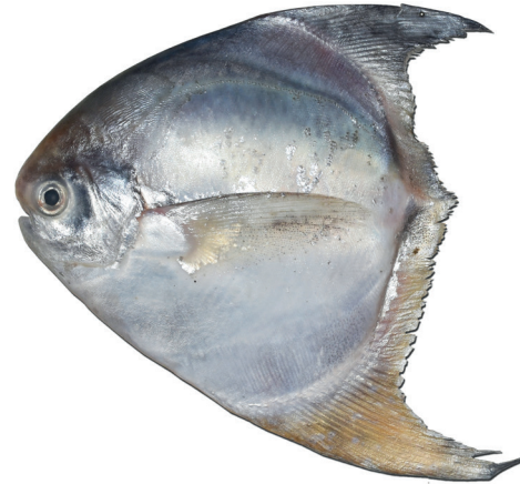
Fig.6. Caudal fin deformity in Pampus argenteus

(Fig.4 & 5). Both the dorsal fins and caudal lobes were poorly developed with the curved vertebrae of tail in the first specimen while the second one was having unfused pectoral fins to the snout forming clefts in both sides. The abnormalities in granulate guitar fish is recorded for the first time from India. Spinal scoliosis and abnormal curvatures in the vertebrae has been reported in several elasmobranch species (Moore, 2015). One specimen of Silver pomfret ( Pampus argenteus , Standard Length (SL) 21.8 cm) was also observed to have an atrophied caudal fin without any dorsal and ventral lobes (Fig.6). This does