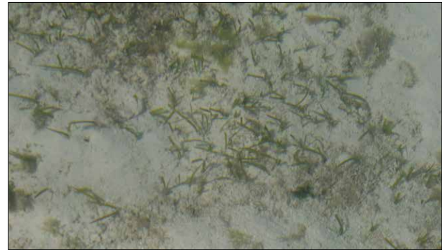
Fig. 4. View of the lagoon in Kavaratti Atoll during November 2015 where a dense bed of Cymodocea serrulata existed in 2011