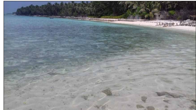
Fig. 5. View of seagrass meadow in the lagoon of Kiltan Atoll during November 2012.