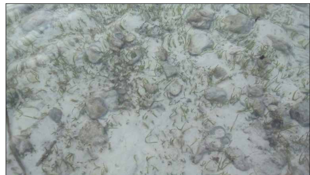
Fig. 6. Close up view of declining seagrass meadow in the lagoon of Kiltan Atoll observed during November 2015.