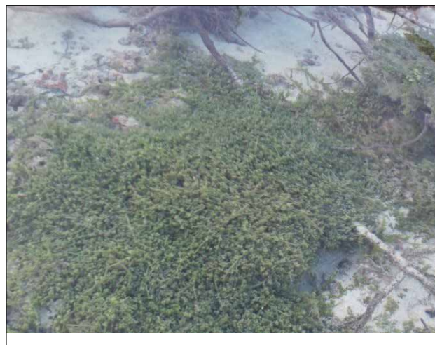
Fig. 7. Bed of green seaweed Caulerpa racemosa found colonised in the degraded seagrass meadow in the lagoon of Chetlet Atoll (Picture taken during Nov. 2015).

Though this communication is made out of observations from only four atolls, the current status of seagrass meadows in other inhabited islands within U.T. Lakshadweep may not be different. Seagrass species as a community serve the atoll ecosystem for its sustainability and hence they are termed as ecosystem engineers, while the mega herbivores such as turtles and other marine mammals are considered as ecosystem modifiers due to their destructive feeding habits