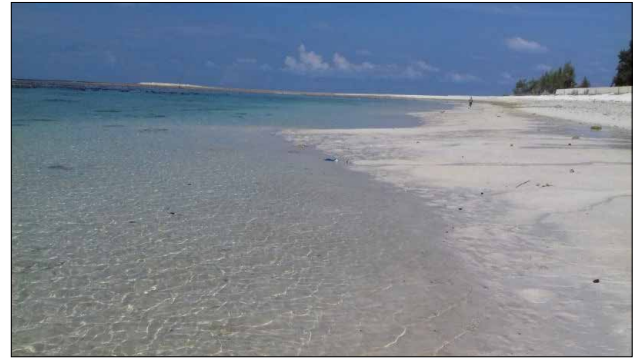
Fig. 3. View of vanished seagrass meadow in the lagoon of Chetlet Atoll during November 2015