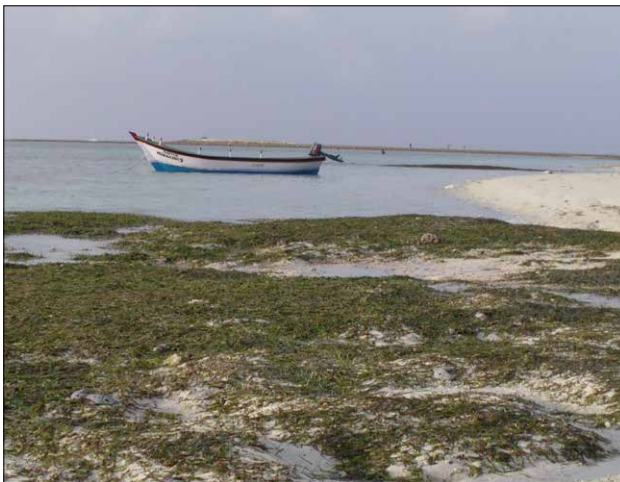
Fig. 2. View of Sea-grass meadow in the lagoon of Chetlet Atoll during December, 2011