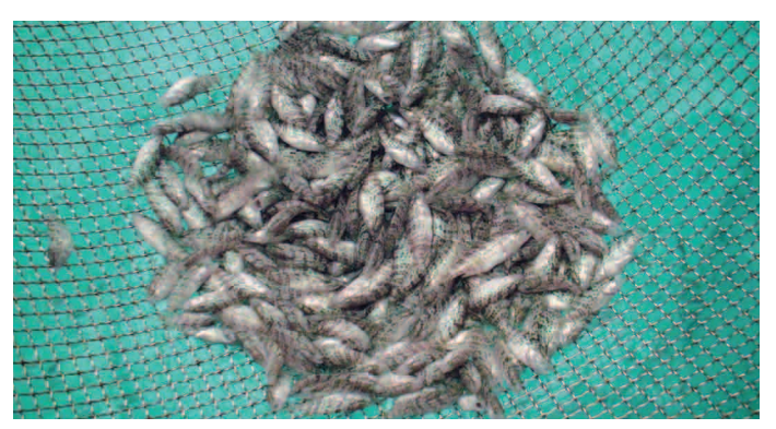
FIGURE 5. Orange-spotted grouper fingerlings at 95 dph.

In general, the survival rate achieved in this trial is encouraging and demonstrates the possibility of successful mass production of grouper fingerlings in captivity under the harsh environmental conditions of Abu Al Abyad Island (Yousif et al. 2011). Such success in orange-spotted grouper fingerling production is expected to give a boost to the emerging aquaculture sector in the UAE and also give impetus