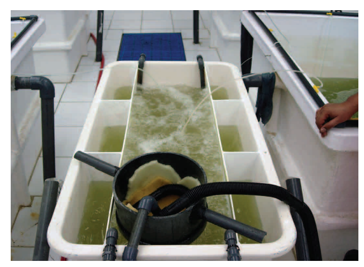
FIGURE 1. Tank for harvesting rotifers (Brachionus rotundiformis).