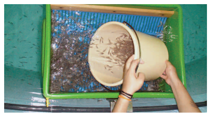
FIGURE 4. Size grading orange-spotted grouper fingerlings.

mg/L, ammonia concentration 0.18 \pm 0.05 mg/L, nitrite concentration 0.021 \pm 0.003 mg/L and pH 7.8 \pm 0.4. All LRTs were harvested on day 40 by reducing water level in the tanks and scooping out postlarvae with hand nets (Fig. 3). The number of 40-d old post-larvae collected was 200,463 averaging 21.1 \pm 4.3 mm total body length and 199 \pm 92 mg body weight. The average survival rate of larvae was 9.3 \pm 4.9 percent.