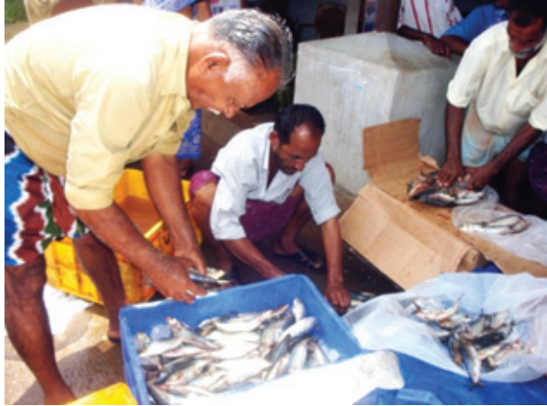
Fig. 3. Oil sardine being repacked for local markets

Oman is well established and average annual catches reported during 2002-09 period was about 35,000 t. They are harvested using beach seines and gill nets