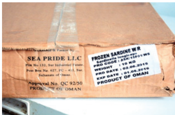
Fig. 2. Cardboard crates containing frozen oil sardine and bearing label with product details

life of one year was brought in trucks. The cartons were opened by local dealers, the sardines unpacked and washed in fresh water, immediately re-iced and despatched to local markets (Figs. 2 & 3). These repacked sardines were priced at ₹ 200 and above per kg which was much higher than the prices of ₹ 100-140 normally got for locally caught Oil sardine. The total length of individual fish ranged from 22-24 cm and weighed on an average 160 g, with 6-8 numbers adding up to a kilogram. During the same period, due to heavy rains and windy weather effects caused by the monsoon, ring seine and gillnet fishing activities were temporarily suspended by the local fishermen leading to low availability of fish in the markets. The supply - demand gap being high, the generally big - sized sardines from Oman fetched a very good price. In the subsequent days also similar market arrivals of Oil sardine from Oman were recorded. A few specimens analysed to gather information on their biology indicated females had developing gonads containing oocytes in early yolk development stage of 0.1 - 0.2 mm diameter size. Guts contained very little food and copepods (zooplankton), Thalassiosira and Peridinium (phytoplankton) were noted. The sardine fishery in