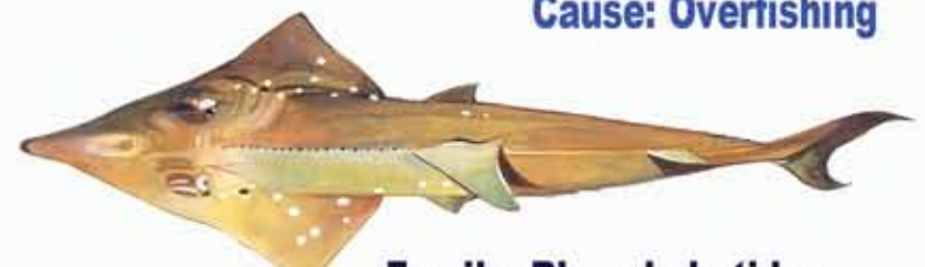
Family: Rhynchobatidae Rhynchobatus djiddensis (Max length 3 m) Giant guitarfish IUCN status: Vulnerable Cause: Overfishing