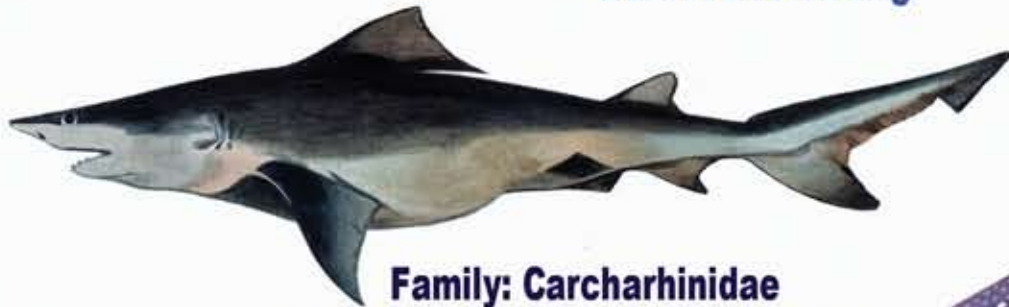
Family: Carcharhinidae Glyphis glyphis (Max length 3 m) Spear-tooth shark IUCN status: Endangered Cause: Incidental killing