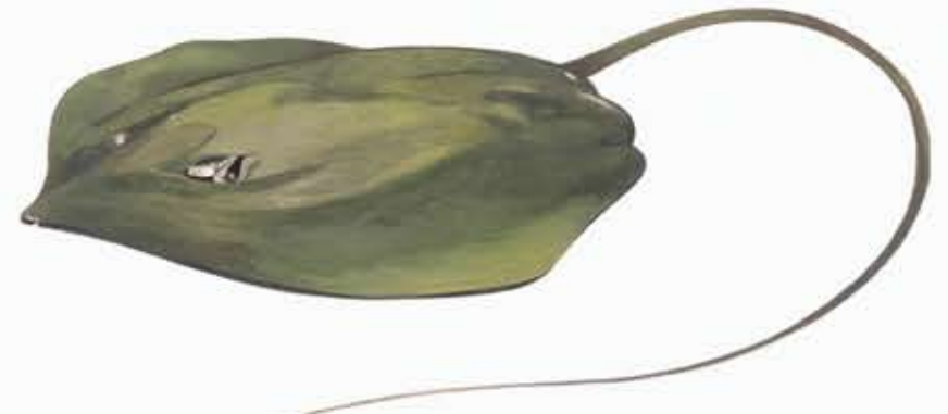
Family: Dasyatidae Himantura fluviatilis (Max length 1.5 m) Ganges sting ray IUCN status: Vulnerable Cause: Overfishing & habitat degradation