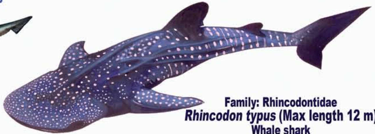
Family: Rhincodontidae Rhincodon typus (Max length 12 m) Whale shark IUCN status: Vulnerable Cause: Harpoon fishing