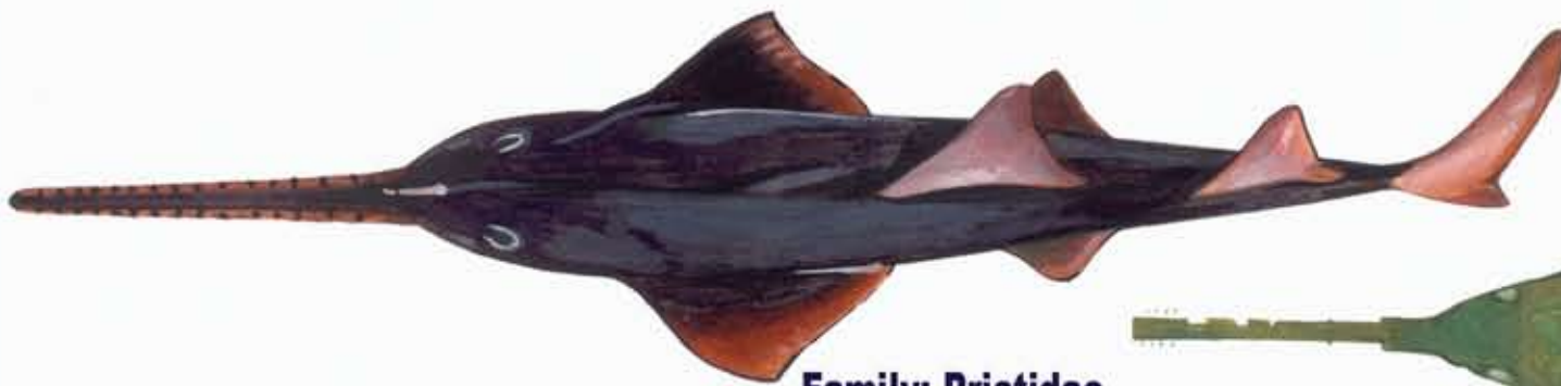
Family: Pristidae Pristis pristis (Max length 7 m) Large tooth sawfish IUCN status: Critically endangered Cause: Overfishing & habitat loss