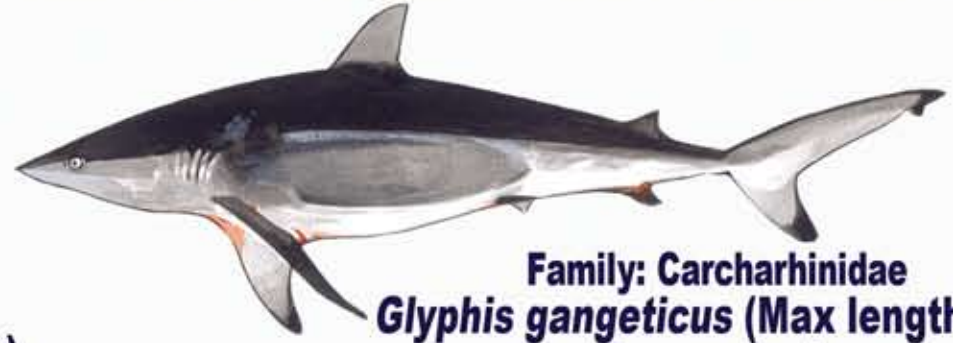
Family: Carcharhinidae Glyphis gangeticus (Max length 2 m) Ganges shark IUCN status: Critically endangered Cause: Overfishing & habitat degradation