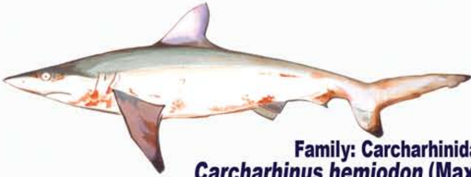
Family: Carcharhinidae Carcharhinus hemiodon (Max length 2 m) Pondicherry shark IUCN status: Critically endangered Cause: Overfishing

भारतीय वन्यजीव (संरक्षण) अधिनियम, 1972 के तहत इन जातियों की किसी भी तरह की पकड़ और व्यापार दण्डनीय है। Capture and trade of these species in any form is liable to be punished under the Indian Wild Life (Protection) Act, 1972