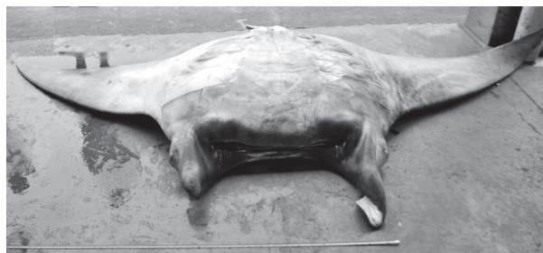
Fig. 1. Giant Devil Manta ray Manta birostris landed at Cochin Fisheries Harbour

Two specimens of giant devil ray, Manta birostris locally known as 'Aanathirandi' measuring 307 and 194.5 cm in TL, 534 and 416 cm in disc width and weighing about 780 and 570 kg respectively were landed at Cochin fisheries harbour on 19.05.14 and 20.05.14 (Fig. 1). Manta birostris are caught generally by gill net and on this occasion these rays were caught from the inshore waters off Cochin at 9°52'N., 9°56' E at a depth of 30-40 m by purse seiner boats. Along the Indian coast, landings of devil