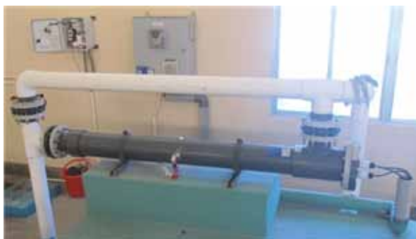
Hormonal administration to cobia