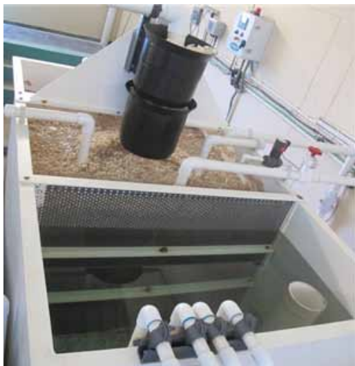
Hormonal administration to cobia