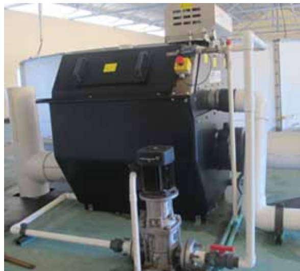
Hormonal administration to cobia