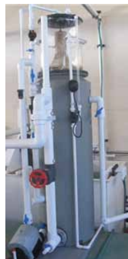
Hormonal administration to cobia