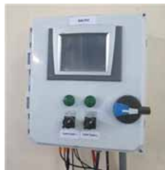
Hormonal administration to cobia