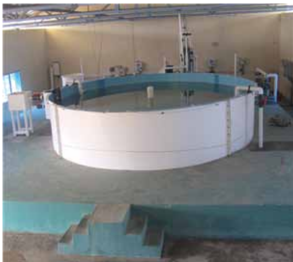
Hormonal administration to cobia

bacteria, algae and pathogens. The capacity and the flow rate of the UV sterilizer/ ozoniser should be calculated based the on quantity of water to be treated and effectiveness of treatment.