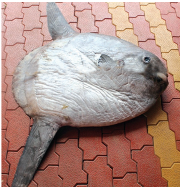
Fig. 1. Ocean sunfish, Mola mola

extremely thick, elastic skin (Fig.1). Also, extensive subcutaneous fat deposits were noted throughout the body. The mouth was small and teeth were fused to form a parrot-like beak. There were four pairs of gills with a slit behind the last gill. The intestines were coiled (Fig.2) with semi-digested matter. The morphometric measurement of the specimen is listed in Table 1. The Mola genus belongs to Molidae family. This family comprises three genera: Masturus , Mola and Ranzania . Molas have a very broad global distribution, occurring in both temperate and tropical waters of the Atlantic, Indian, and Pacific Oceans. They are pelagic and swim at depths of up to 600 m. The extensive fat