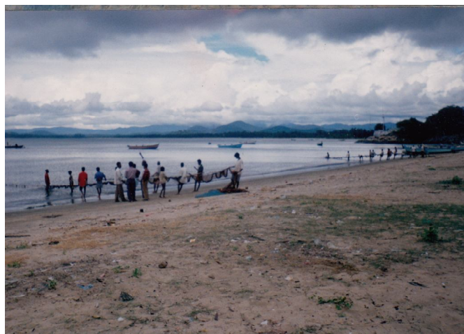
Photograph 4 Harvesting fish with Minirampani in Karwar of Karnataka