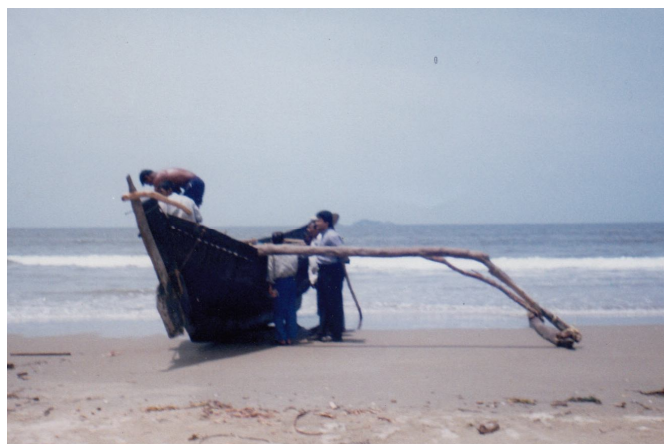
Photograph 5 Outer rigger canoe in Dhandebag of Karnataka