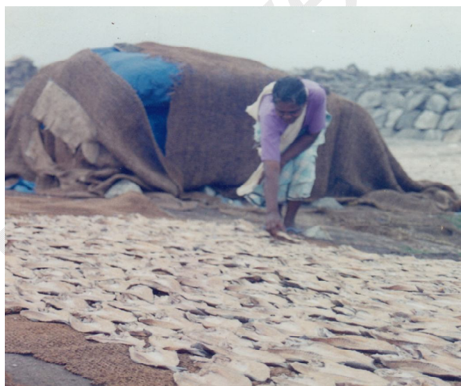
Photograph 6 Salt drying of fish in Baithkol of Karnataka

practices preserve the fish excellently. Pouring lemon juice over fish is a common indigenous practice which will preserve the fish for a sufficiently longer span of time. Simple sun drying of silver belly fish and simple sun drying of cynoglossus with salt and without salt, simple drying of mackerel with salt, drying in cement tanks after mixing with salt, bamboo rack drying technique of fish etc. are all commonly practiced preservation techniques in the arena of ITK wisdom. ITKs on preservation techniques are presented in table 5. Salt drying of fish in Baithkol of Karnataka and mixing of fish with wet sand for preservation in Majali of Karnataka are shown in photographs 6 and 7 respectively.