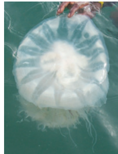
Rhopilema cf. hispidum