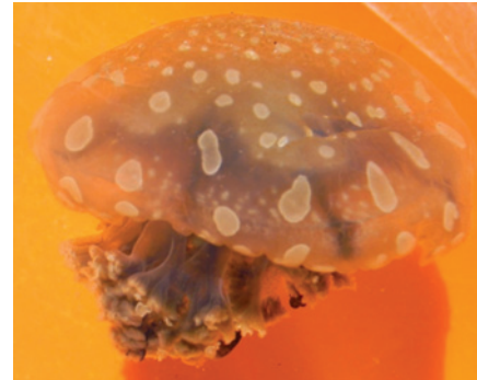
Mastigias cf. papua (Lesson)

Four species of scyphozoan jellyfishes have been recorded from Palk Bay and Gulf of Mannar viz., Cassiopea cf. andromeda (Forsskål, 1775), Chrysaora caliparea (Reynaud, 1830) [species inquirenda ], Mastigias cf. papua (Lesson) and Rhopilema cf. hispidum . The species Cassiopea cf. andromeda has been recorded from Tuticorin coast and the remaining three species have been recorded from Mandapam and Thiruppalaikudi coast of Palk Bay. The Rhopilema sp. is an edible jellyfish and are commercially harvested for export market. All the species of the genus Chrysaora can inflict painful stings and cause severe scars.