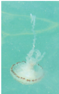
Chrysaora caliparea (Reynaud, 1830) [species inquirenda ]