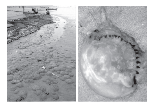
Fig. 1. Jellyfish landed in rampan operation

Unusual heavy swarming of jellyfishes were noticed along the Sindhudurg coast of Maharashtra during the months of October and November 2012. The jellyfishes, locally known as zhar/belaka, had dark yellowish gelatinous umbrella shaped bell and trailing tentacles. On 6<sup>th</sup> November 2012, a total of 1000 kg of jellyfishes were landed in two rampan (shore seine) operations along with oilsardine (Fig. 1). Rampan as