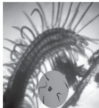
Fig. 3. Polydora removed from its dwelling tube; Inset: Polydora stretching out from the tubes

The polychaete worm is yellowish brown/deep red in colour, about 3 cm long, segmented and has numerous bristles and tentacles all along the segmented body. The anterior region has several palps waving vigorously, and the posterior end is almost blunt and saucer shaped (Fig. 3 and 4). Another form of the Polydora sp. was also observed which had several palps on the anterior end, highly segmented body and lateral bristles but tentacles were absent. A tapering tail which was almost blunt and saucer shaped was present in this form (Fig. 5).