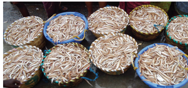
Fig. 2. Landings of Bleekeria sp. at Chennai

Harbour on 7 th July 2011. The size range of the fishes was 110-144 mm with the dominant mode at 120-124 mm. The fish was sold at the rate of ₹ 40 per kg at the landing centre.