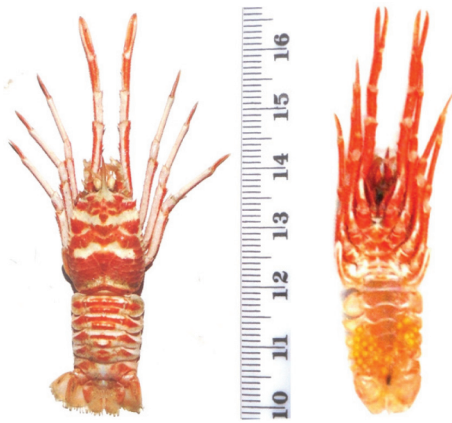
Fig. 1. Munidopsis scobina -berried female (dorsal and ventral view)

orange with white horizontal bands on carapace and edges of abdominal segments. The telson was light orange in colour. The eggs were large and yellow in colour, carapace with dorsal spines and interrupted striae after the cervical groove, the rostrum smooth, eyes small and movable. It has been recorded from Andaman Sea at 439 m in 1894, Bay of Bengal at 265-458 m in 1894, northern end of Bay of Bengal at 353-748 m in 1901, and off Kollam at 180-400 m in 1974. The present record in 2011 is from Chennai coast at 200-400 m.