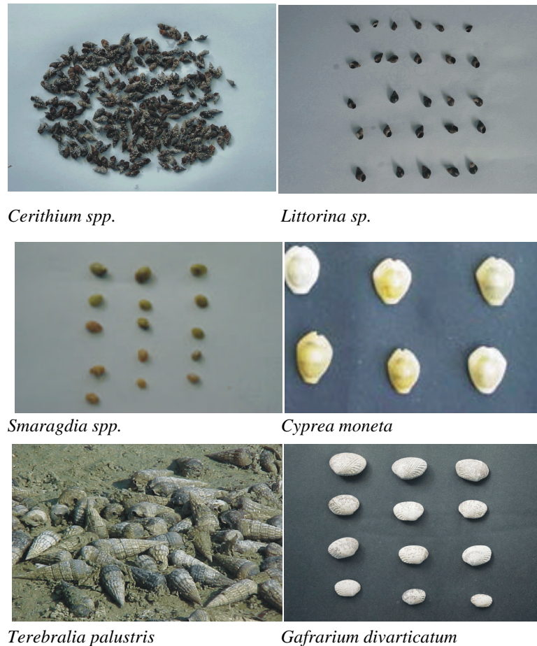
Fig. 3: Major species of benthic molluscan fauna obtained from the study area

complexity in seagrass ecosystems plus an abundance of food from decaying seagrass and organic sedimentary material support these large and diverse populations of molluscan fauna in such ecosystem [7]. In comparison among the molluscan assemblage from the mangroves of Godavari and Krishna estuarine ecosystems, Raut [8] recorded a total of 95 species of molluscs belonging to 11 genera. Saravanakumar [9] recorded 17 species of gastropods and 16 species of bivalves in the Arid Zone Mangroves of Gulf of Kachchh. A total of 37 species of molluscs were recorded in Pondicherry mangroves [5], among them 16 species of bivalves belonging to 7 families and 12 Genera and 21 species of gastropods belonging to 14 families and 19 Genera, with the Cerithedia cingulata being the dominant group.