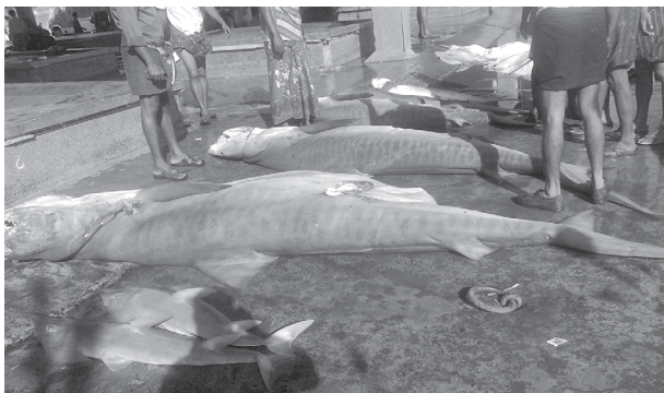
Fig. 1. Galeocerdo cuvier landed at CFH

A female tiger shark of 4 m length weighing approximately 2.5 t was caught in a drift gillnet accidentally and was landed at Cochin Fisheries Harbour (Fig. 1) on 25 th January 2011. The tiger shark had a belly full of advanced embryos. While it was being loaded into the insulated vehicle, the body sagged to one side. Later due to the difficulty in loading its body into the truck, the belly was cut open. From the placenta, thirty advanced embryos of 70-75 cm in length were taken out (Fig. 2 and 3). Then the whole body, the liver and the advanced embryos were carried off for sale.