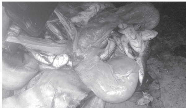
Fig. 2. Young one of G. cuvier being taken out of the pregnant female tiger shark