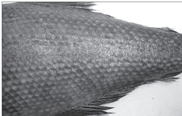
Fig. 2. Close up view of spine like scales of R. pretiosus

but, Lepidocybium flavobrunneum and Ruvettus pretiosus belonging to the family Gempylidae have been reported from large meshed gillnets along Tuticorin coast in the Gulf of Mannar during 2004-2006 by Balasubramanian (2007). A specimen of R. pretiosus (Fig. 1 and 2) belonging to the family Gempylidae (snake mackerels), measuring 553 mm with a weight of 1030 g was recorded from trawl landings at Chennai Fisheries Harbour in the first week of March 2009. The trawler operated between 150 and 200 m depth, at a distance of 250 - 300 km along the north-east towards the Nagapattinam coast. The oil fish, R. pretiosus has a very rough skin, the scales are interspersed with spinous bony tubercles and its body is uniformly dark blue in colour. Its stomach was empty and the gonad was mature. The morphometric measurements of the specimen are given in Table 1.