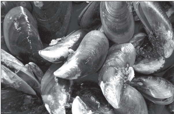
Fig. 1. Green mussel, Perna viridis (Linnaeus, 1758) from Versova creek

crevices. The samples were brought to the laboratory for length-weight analysis. The shells had darker shade (Fig. 1). Shell length (L) was measured using a digital caliper and total weight (W) (+ 0.01 g) was determined using an electronic balance after the specimens were dried on blotting paper. A total of 675 specimens ranging in length from 14 to 89 mm with the corresponding weight ranging from 0.495 to 37.612 g were analysed over a period of four years from January 2005 to December 2008.