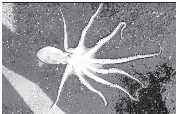
Fig. 1. Cistopus indicus (Orbigny, 1840)

Since Mumbai accounts for 60% of the total fish landings in Maharashtra (Annam and Sindhu, 2005), the catch statistics from Mumbai can be considered as representative for the state. The catch data was obtained from the commercial trawl landings at New Ferry Wharf, Sassoon docks and Versova in