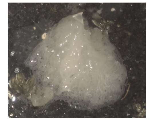
Fig. 1. Clathrina clara: specimens found on Pinctada fucata shell.

Latin clarus (= bright). Describing the bright surface (Klautau & Valentine, 2003).