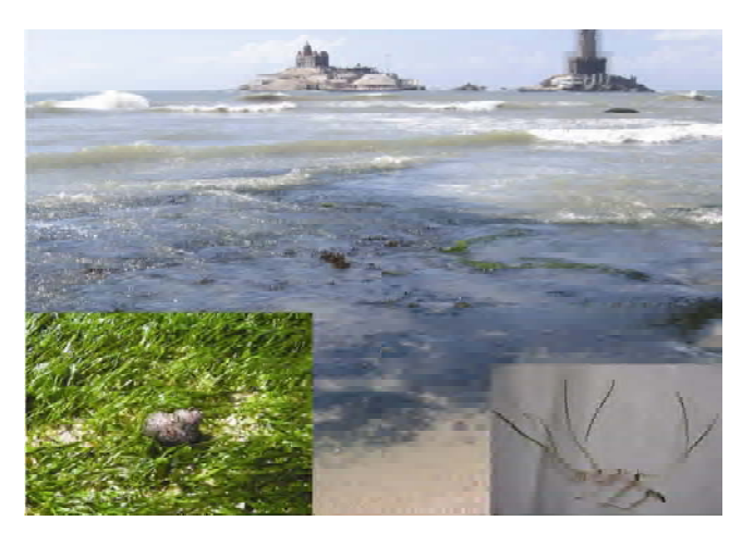
Plate 1-Station location

colonies growing around the sea grass blades were segregated and purified. Purified typical bacterial colonies were characterized by standard biochemical tests, antibiotic sensitivity pattern and 16s RNA sequence data method.