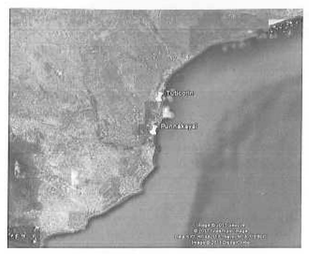
Figure 2. Satellite map showing Tuticorin and Punnakayal in Tamil Nadu, India

This study reveals the pattern of current exploitation of sea turtles along the Tuticorin coast. Most of the fishermen confirmed that those turtles that were entangled in nets and were still alive were taken for consumption. Sea turtle populations in this area have been reported to have declined due to their over-exploitation for trade and from accidental drowning in fishing gear such as gillnets and trawlers (Bhupathy & Saravanan, 2002). This study therefore recommends that government officials should periodically check whether fishermen use TEDs (Turtle Excluder Devices) in their fishing nets.