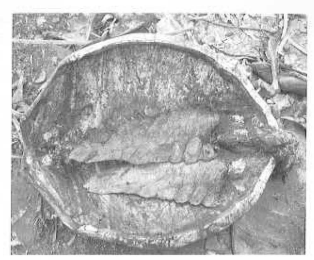
Figure 3. Carapace and flippers of a freshly killed olive ridley turtle.

This study reveals the pattern of current exploitation of sea turtles along the Tuticorin coast. Most of the fishermen confirmed that those turtles that were entangled in nets and were still alive were taken for consumption. Sea turtle populations in this area have been reported to have declined due to their over-exploitation for trade and from accidental drowning in fishing gear such as gillnets and trawlers (Bhupathy & Saravanan, 2002). This study therefore recommends that government officials should periodically check whether fishermen use TEDs (Turtle Excluder Devices) in their fishing nets.