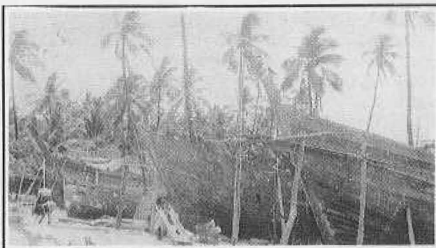
Fig.2. Boats under construction at Versova on the land of Charitable trust

For speedy navigation and effective operation of gear, boats should be in perfect order and without any kind of leakages. In Versova, repairs of boats are mostly undertaken during off-season i.e. during