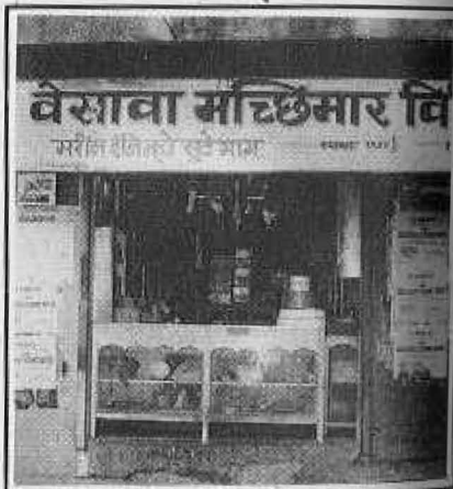
Fig.1 Department store and spare parts division of "Vesava Machhimar Vividh Karyakari Sahakari Society Ltd."

Workshop and supplies: Since workshops are indispensable for such activities, Versova fishermen themselves started running three workshops locally. Proximity of these workshops to the landing centre came as an added advantage. Items like twine, ropes, paints, iron made parts and other miscellaneous articles are now made available through the societies which procure these materials directly from the authorised dealers or manufacturers and supply them with minimum profit.