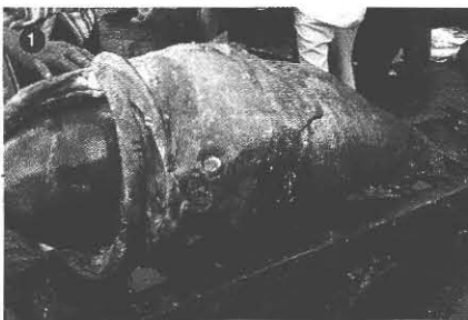
Fig.1: Dorsal view of Promicrops lanceolatus (Bloch,1970) landed at New Ferry Wharf, Mumbai on 16.12.2006