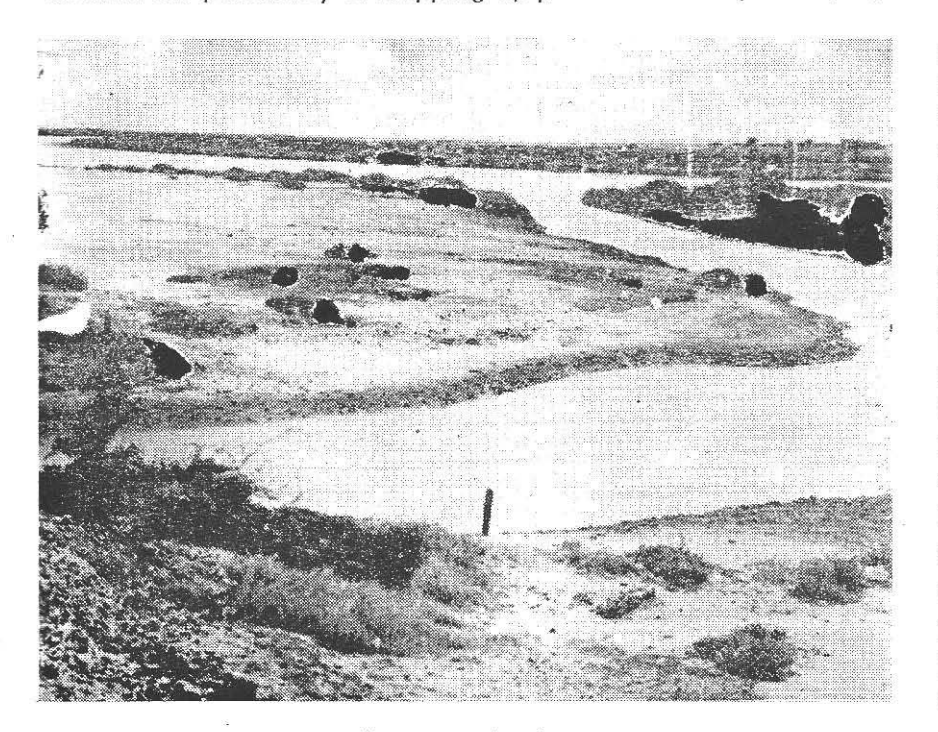
Fig. 1. A tidal inlet

The term 'brackishwater' has somewhat wide connotations. From the stand point of fisheries potential we are concerned with such aquatic environments like river open-