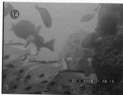
Fig.14: Assemblage of perches in the reef