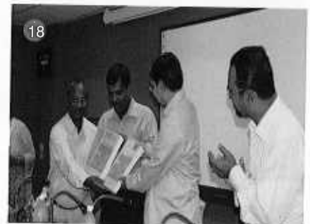
Fig.18: The report being received by the Commissioner of Fisheries, T.N.