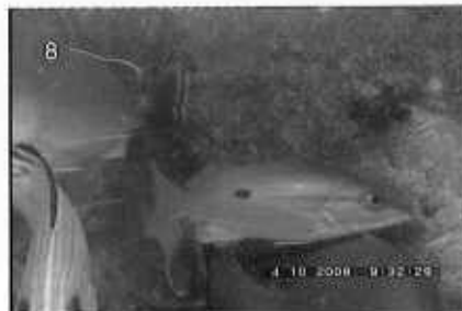
Fig.8: Fish assemblage in artificial reefs