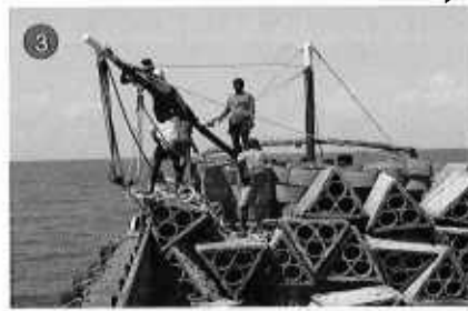
Fig.3: Deployment process of grouper modules with pulleys