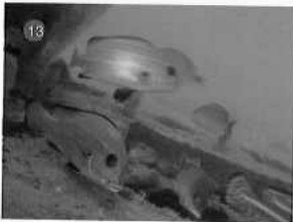
Fig.13: A group of Diagramma spp. In artificial reef