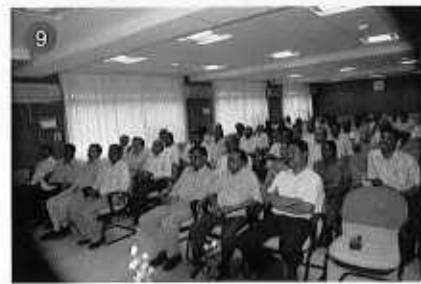
Fig.9: A view of the audience at the function