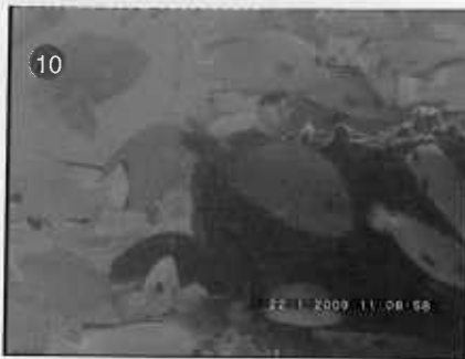
Fig.10: Different species of fishes in artificial reefs