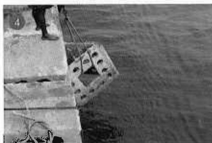
Fig.4: Lowering the module into the sea