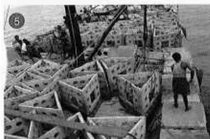
Fig.5: Boat loaded with reef modules