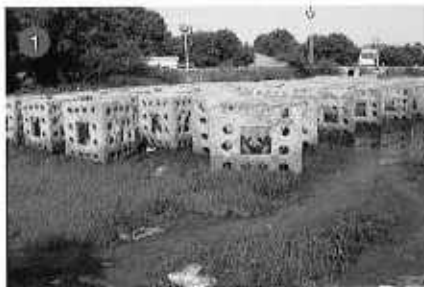
Fig.1: A series of finished reef fish modules

The pioneering work done for the establishment of the artificial reefs was presented in the report of the Mission, a brief summary of which is presented hereunder. Tamil Nadu Government identified 11 locations, two in each of the districts of Thoothukudi, Ramanathapuram, Pudukottai, Thanjavur, Nagapattinam (vide G.O.Ms.No.155, Animal Husbandry and Fisheries Department dated 29.3.2005) and one in Cuddalore, which was added later. Tamil Nadu Fisheries Department approached Central Marine Fisheries Research Institute with a request to undertake the