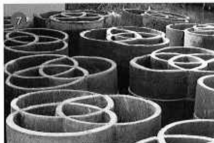
Fig.7: A series of finished triple ring modules