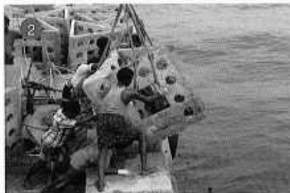
Fig.2: Reef modules being readied for lowering into the sea