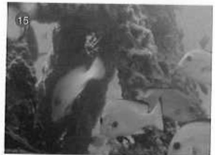
Fig.15: Reef fishes with heavy settlement of foulers in reef