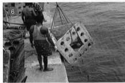
Fig.6: Deployment of reef fish modules