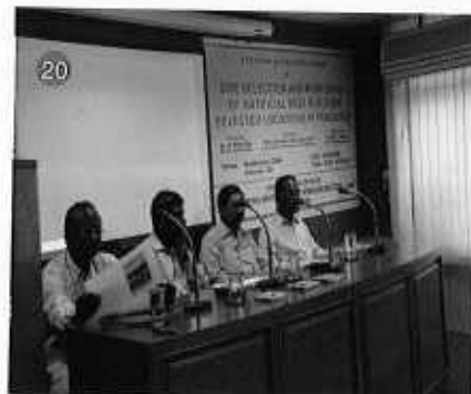
Fig.20: Dignitaries on the dais