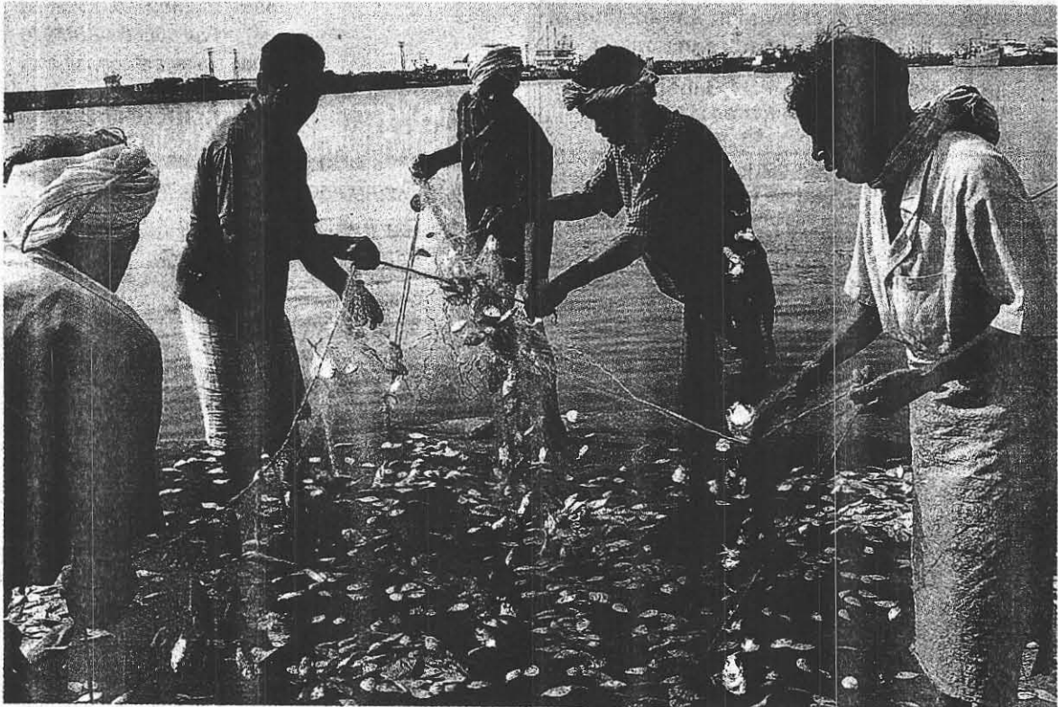
A group of fishermen emptying their catch brought from the catamarans, at a fishing harbour in Visakhapatnam.

Many of these species will suffer impaired ability to build skeletons as pH decreases. We know less about the direct impacts of acidification on harvested species like fishes and squids. In these species, the response to acidification is likely to involve physiological diseases including acidosis of tissue and body fluids leading to