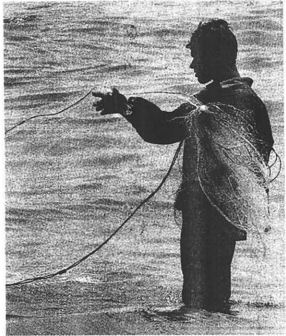
Fishing in the coastal area of Thoduvali in Nagapattinam district.

Another important effect of climate is the primary and secondary production in the sea. Primary production is the synthesis of new plant matter by floating microscopic