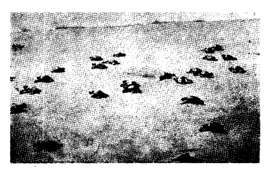
TO THE KINDLY WAVES: The freshly hatched out youngones scramble down the shore when released.

lant carnivorous birds and mammals. With this continuous slicing away, as it were, a block from its two ends, the turtle today is fast diminishing to the point of extinction.