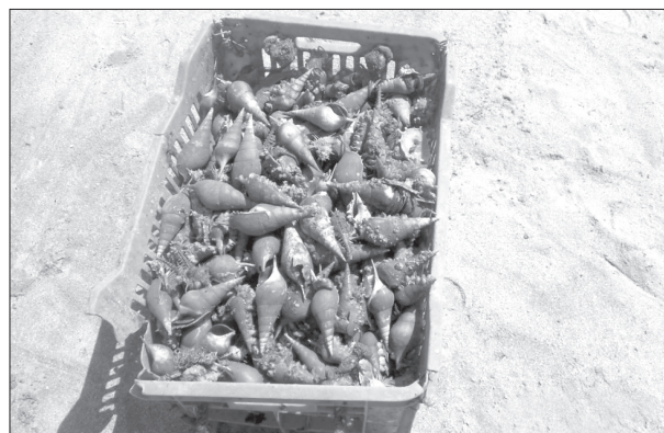
Fig. 4. Tibia maculata and T. curta landed by gillnets along with lobsters at Porbunder

Similar observations were made on the gastropod fishery at Porbunder Landing Centre also. Majority of the gastropods recorded were Tibia sp. (Fig. 4) and other gastropods such as Archipecten sp. and Murex sp. were found to be in negligible numbers. In Porbunder, gillnets are operated in the morning hours and hauling is done in the afternoon after a duration of 5 to 6 h wherein lobsters are got along with fish and gastropods. The percentages of live and dead gastropods were 82 and 18 respectively. The size group of the gastropods ranged between 117 and 146 mm with the dominant size group being 140-144 mm forming 34.5%. About 79% of the gastropods were found to be between 125 and 144 mm.