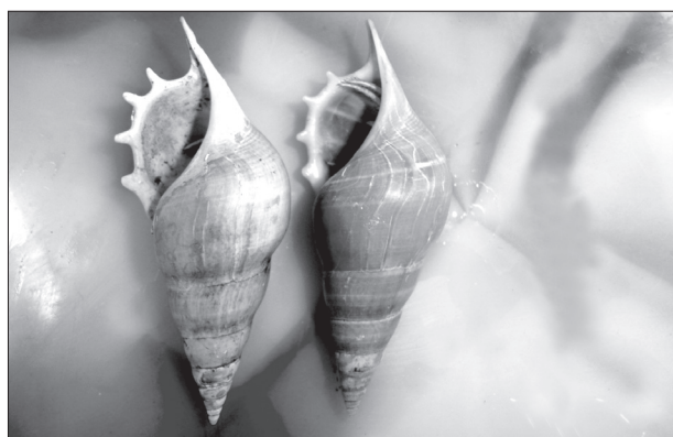
Fig. 3. Tibia curta caught as by-catch along with lobsters by gillnetters at Mangrol

alive and 29% were dead and were mostly occupied by the hermit crabs. The size range of the gastropods varied between 71 and 136 mm with