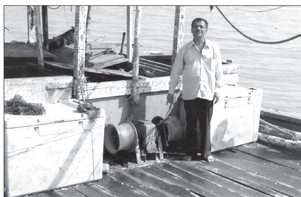
Fig. 1. Improved mechanisation in dolnetting along the Saurashtra coast