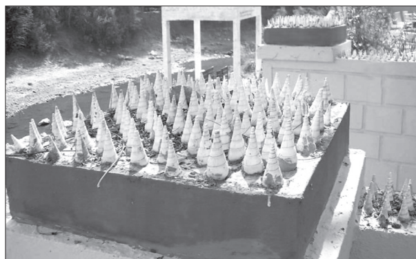
Fig. 5. Cleaned and painted shells of gastropods embedded on the compound walls of temples

These gastropods are kept in heaps at the landing centres, sundried and after cleaning and painting they are used for aesthetic purposes. The shells are very neatly and beautifully embedded in cement on the compound walls of temples and houses in and around Mangrol (Fig. 5).